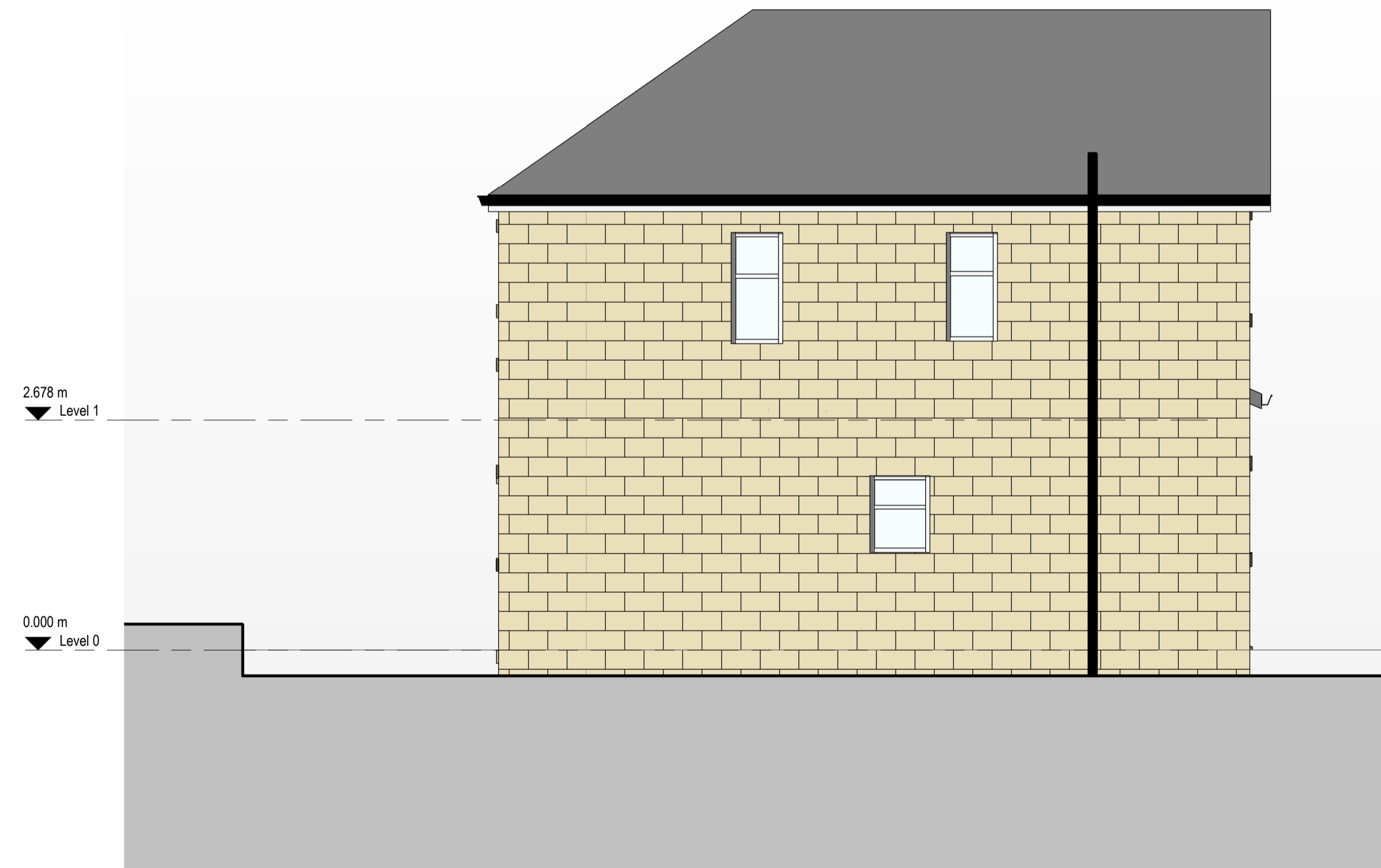
1 Side Elevation 1 : 50