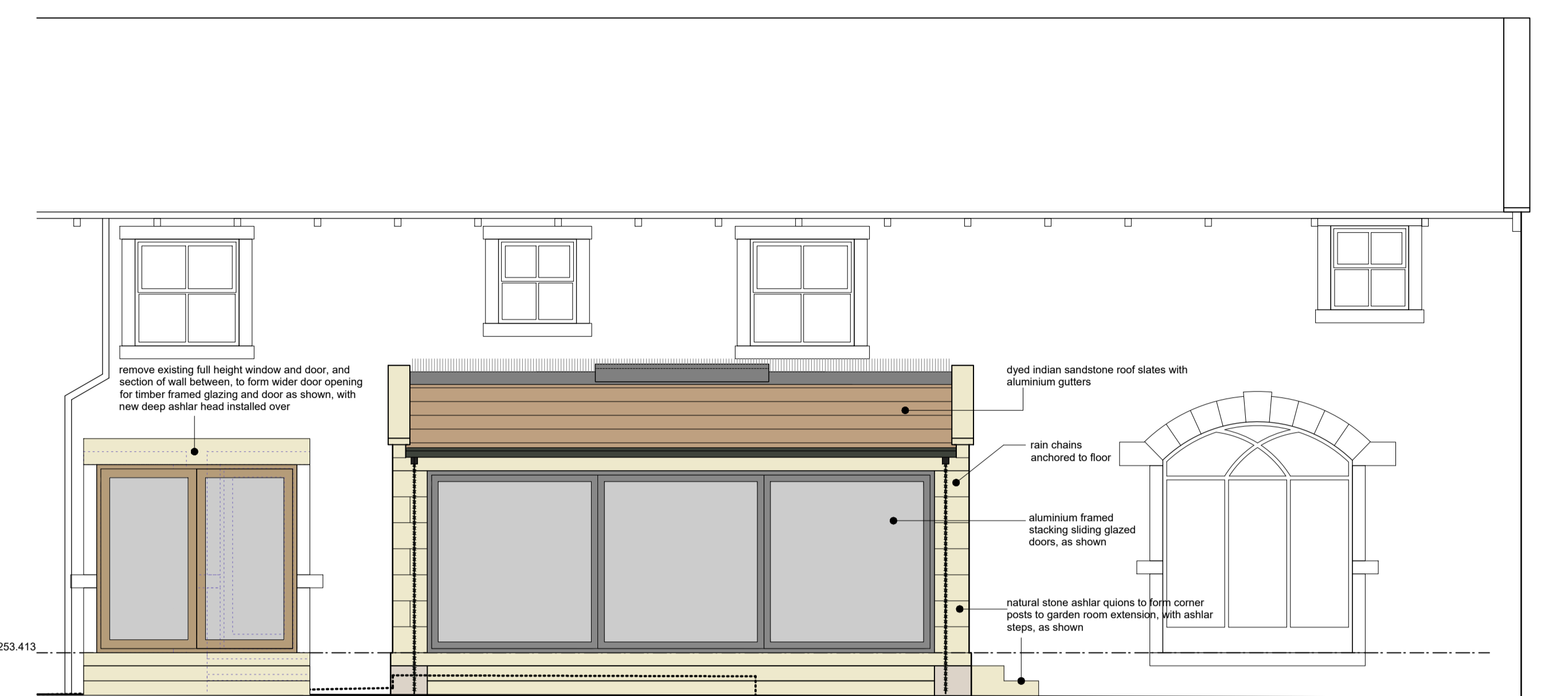
south west elevation (rear)