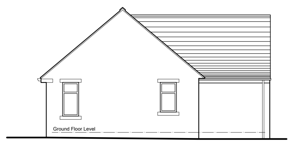
North West Elevation (side)