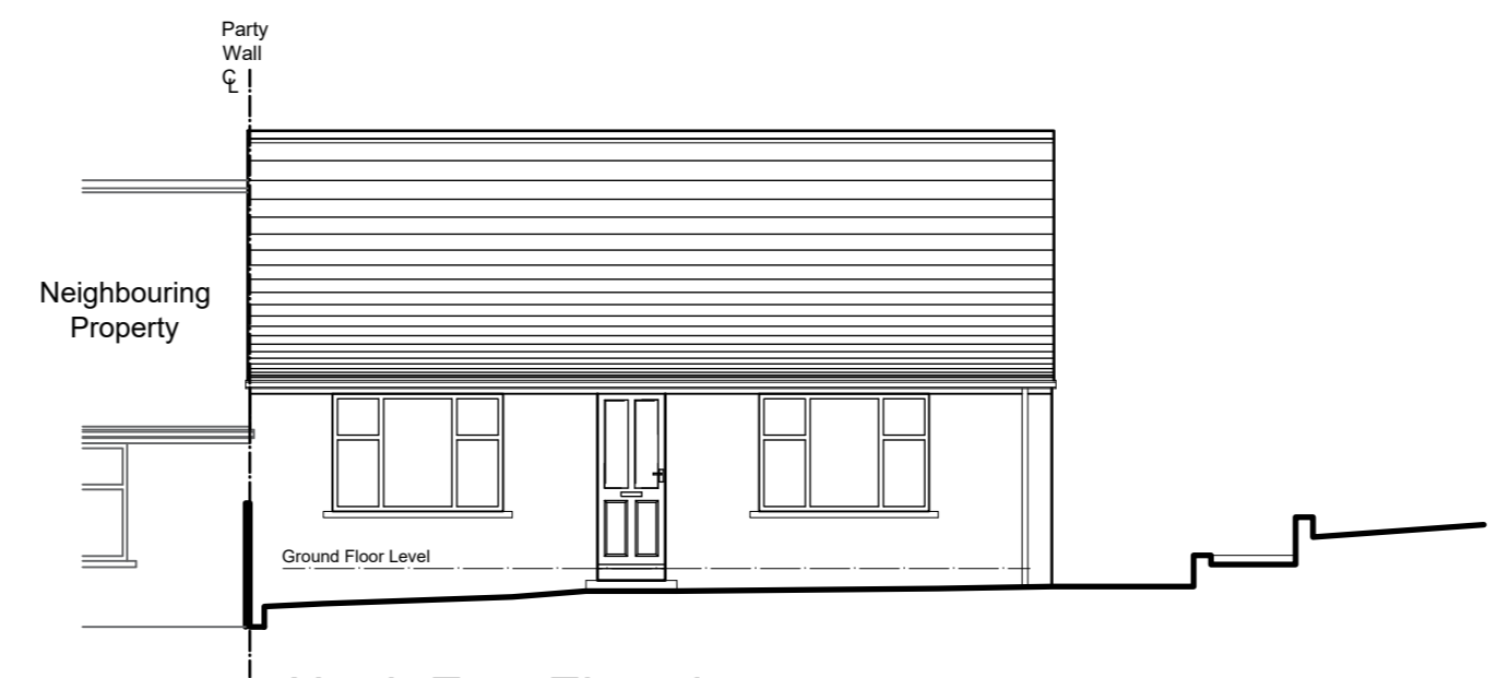
North East Elevation (front)