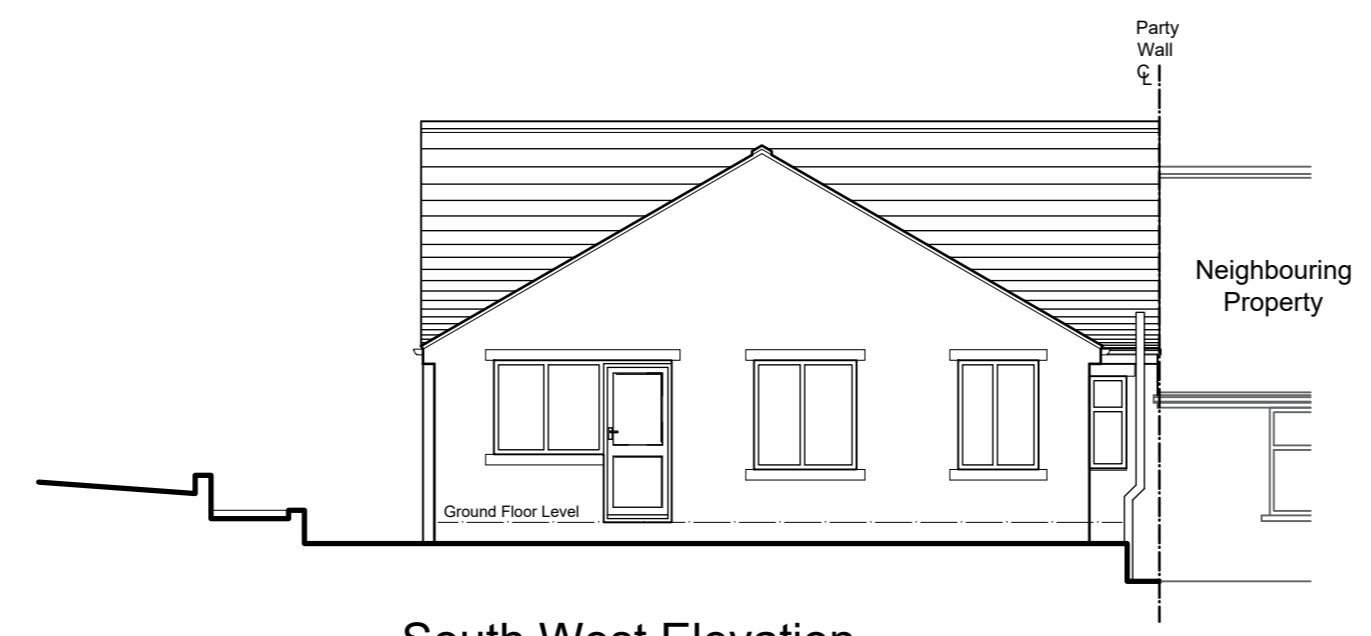
South West Elevation (rear)