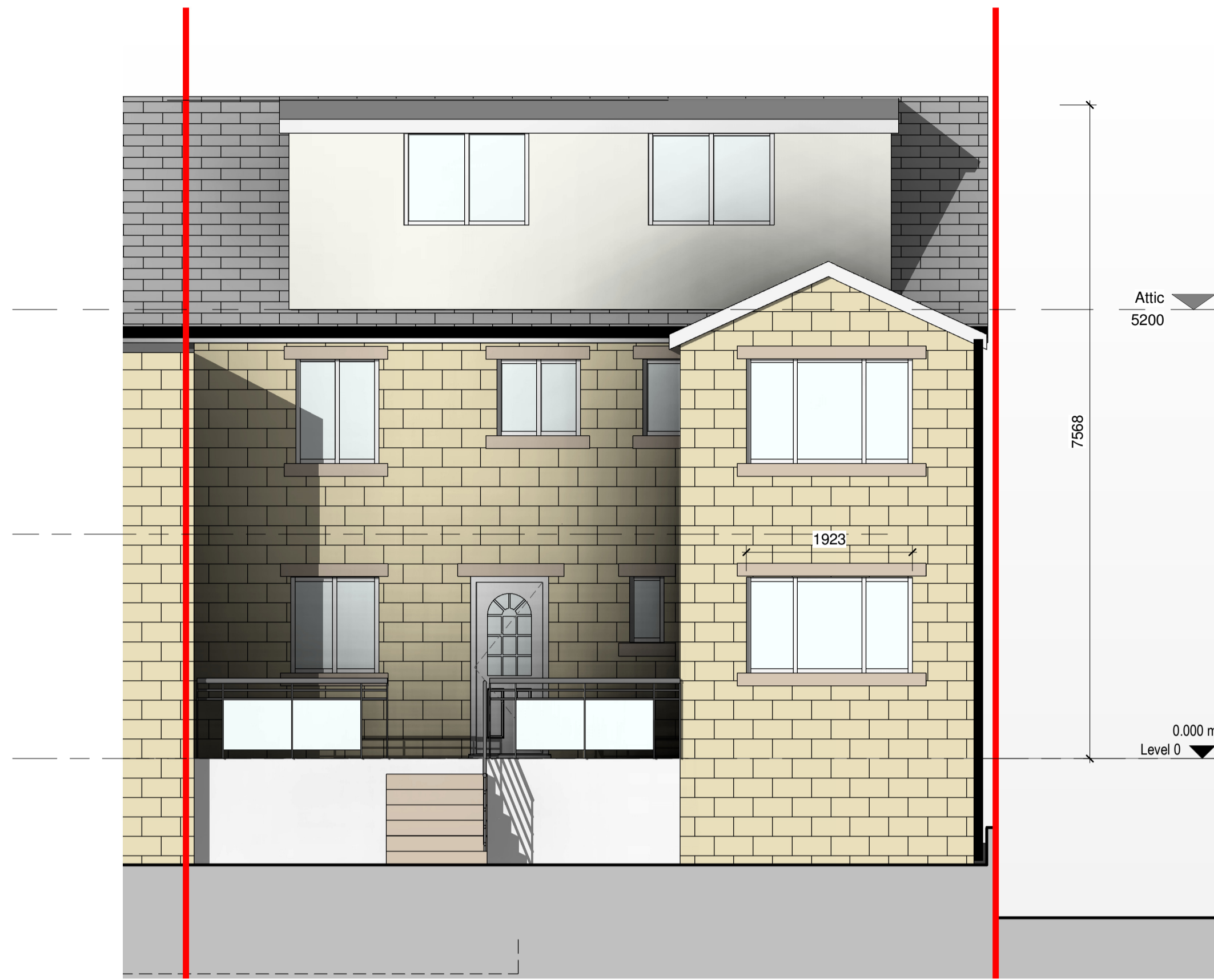
4 Rear Elevation 1 : 50