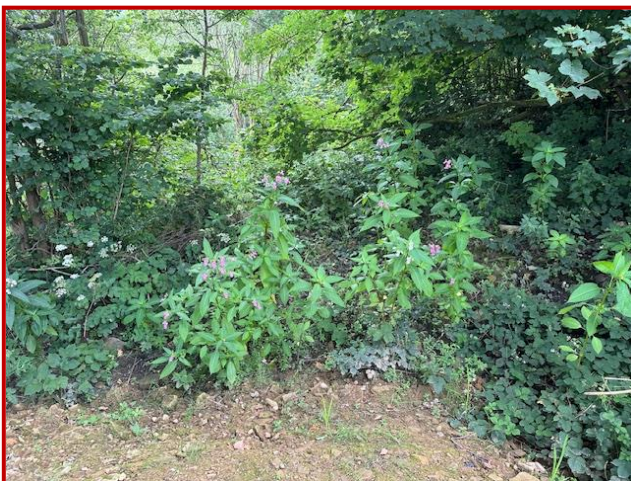
The access terminates at a drain, the picture shows the end of the access and the drain is within the foliage and cannot be seen.