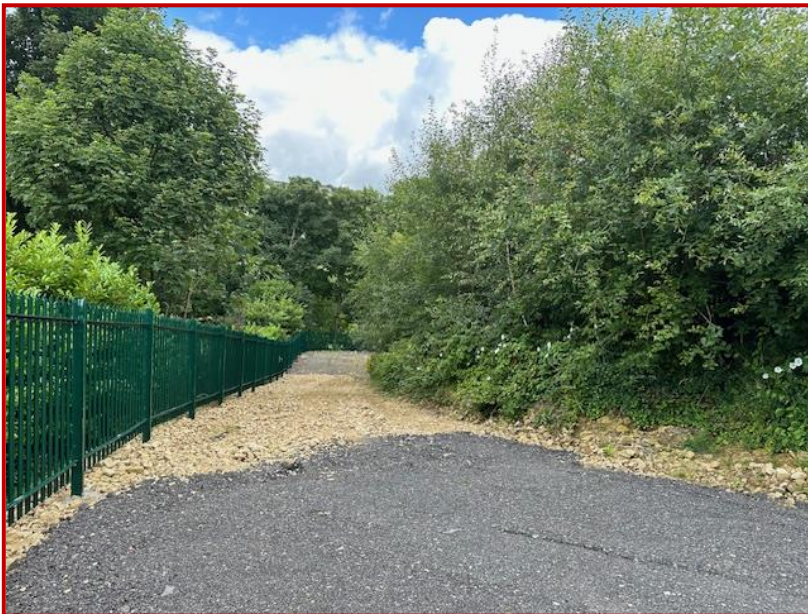
The surfacing changes at the bottom of the access to stone chippings.