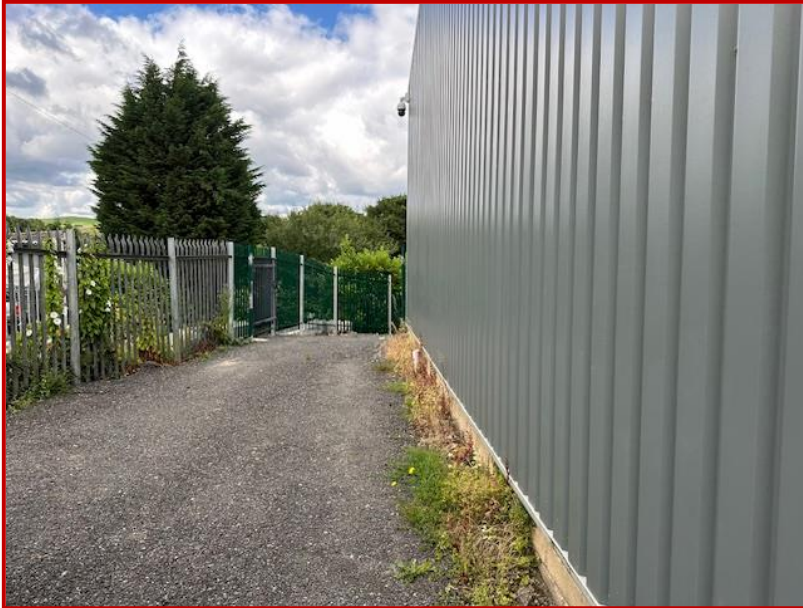
Down the side of the building the surface is scalping. the surface is porous.