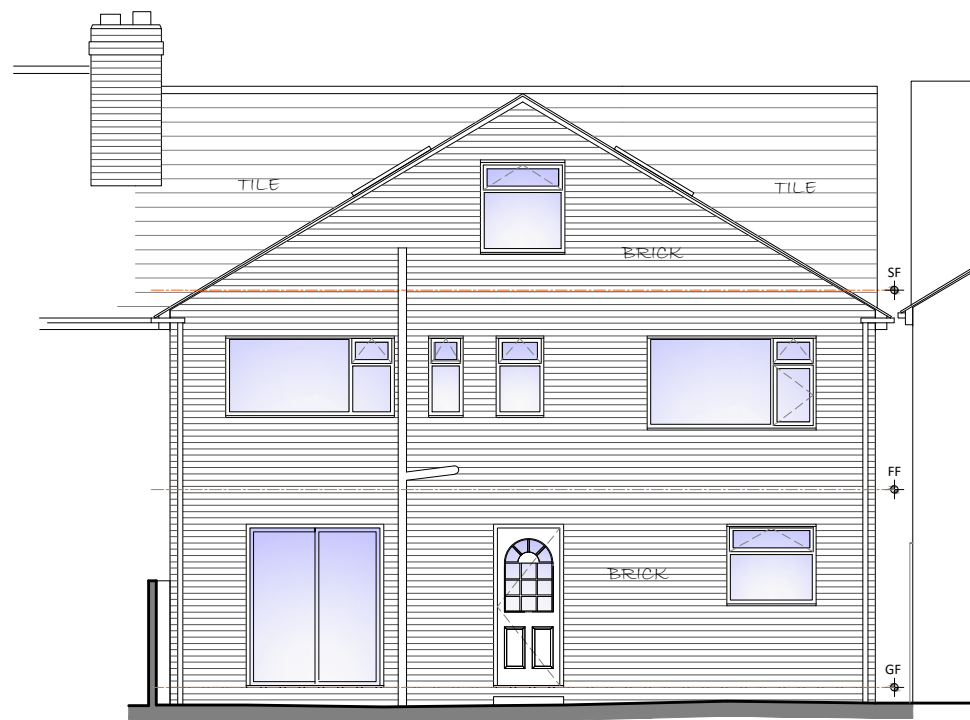
PROPOSED SOUTH (REAR) ELEVATION SCALE - 1:100