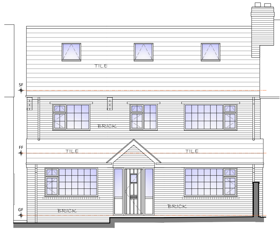
PROPOSED NORTH (FRONT) ELEVATION SCALE - 1:100