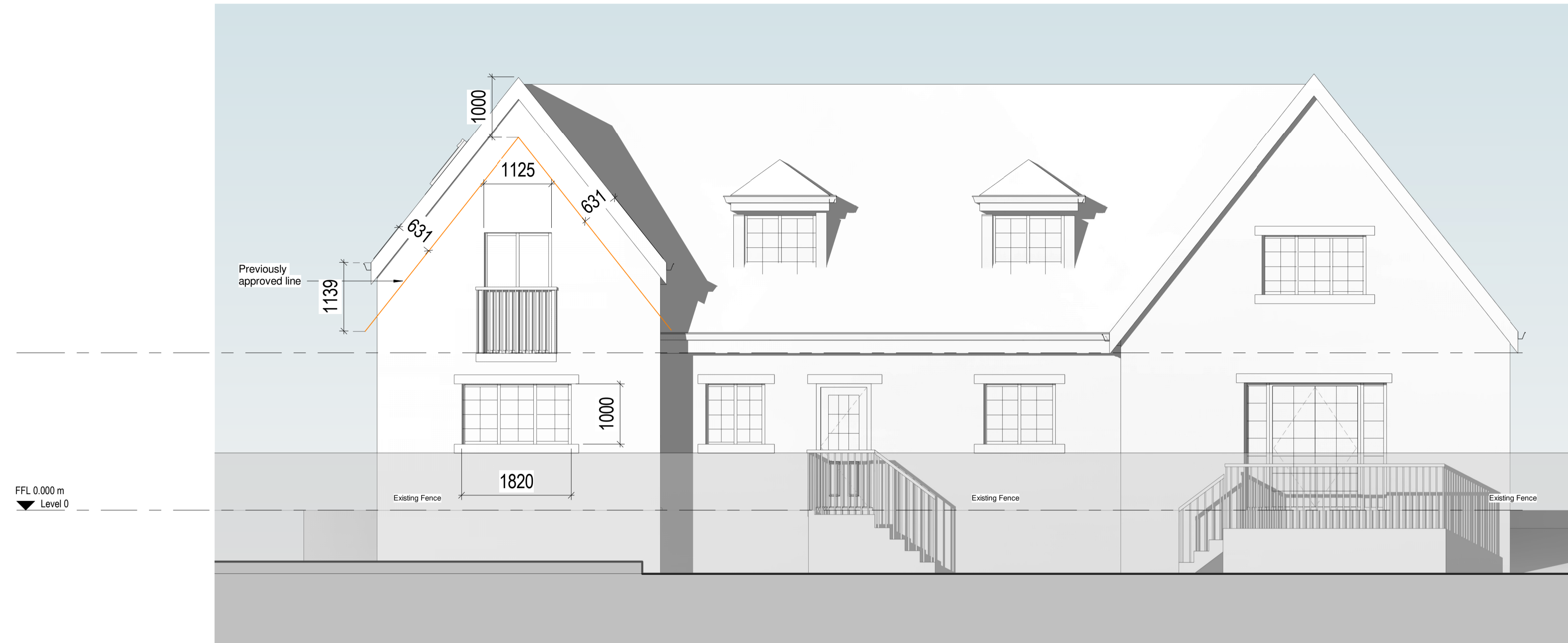
1 Rear Elevation 1 : 50