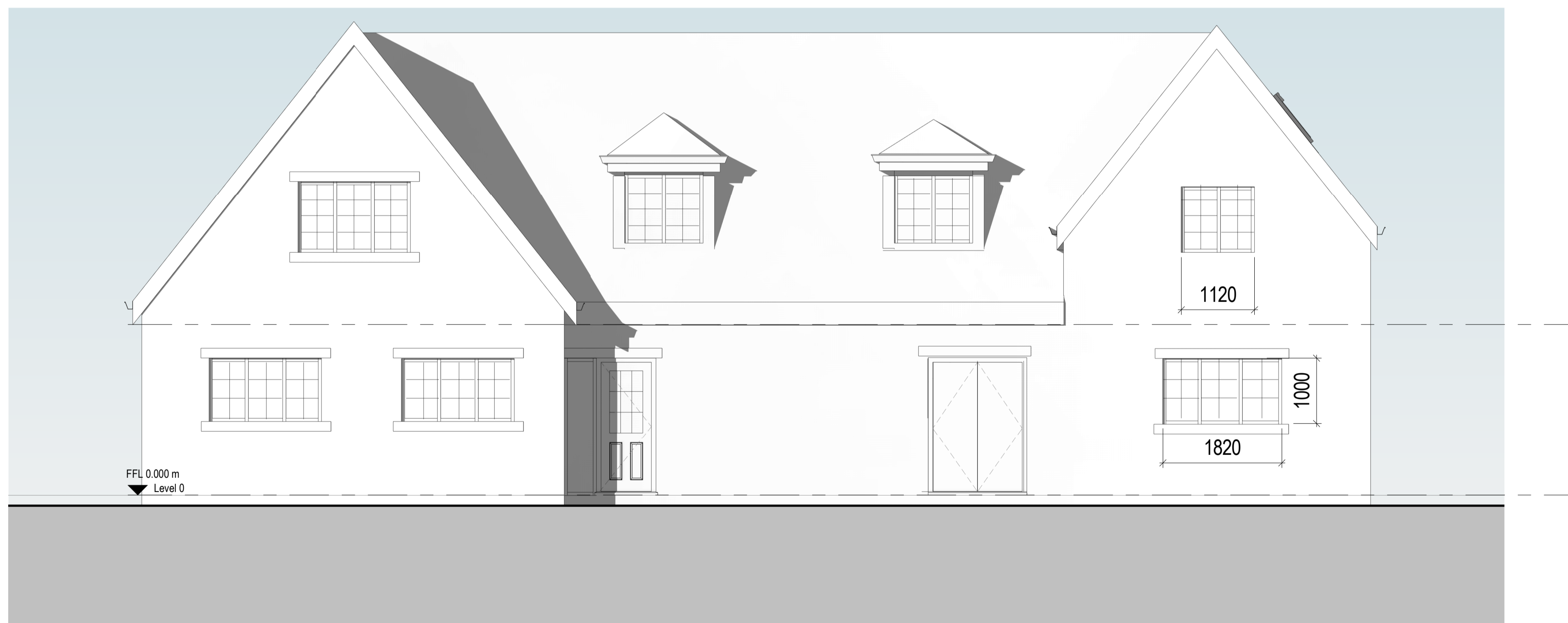
2 Front Elevation 1 : 50