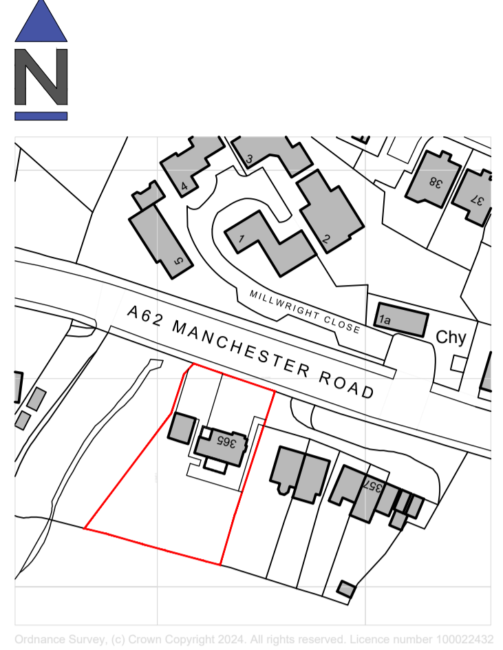
3 SITE LOCATION PLAN SCALE 1:1250

Do not scale from this drawing. Northlight Architectural Consultants Ltd must be notified immediately should any discrepancies be found. The contractor must check all dimensions on site before construction or manufacture of materials. This drawing or any portion of it may not be reproduced without the consent of Northlight Architectural Consultants Ltd.