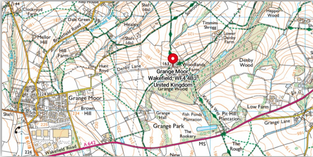
Figure 1: OS Map showing Site location (Bing Maps)