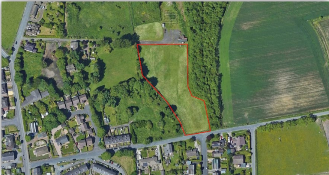
Figure 2: Aerial Image of Site with approximate red line boundary (Google Earth)