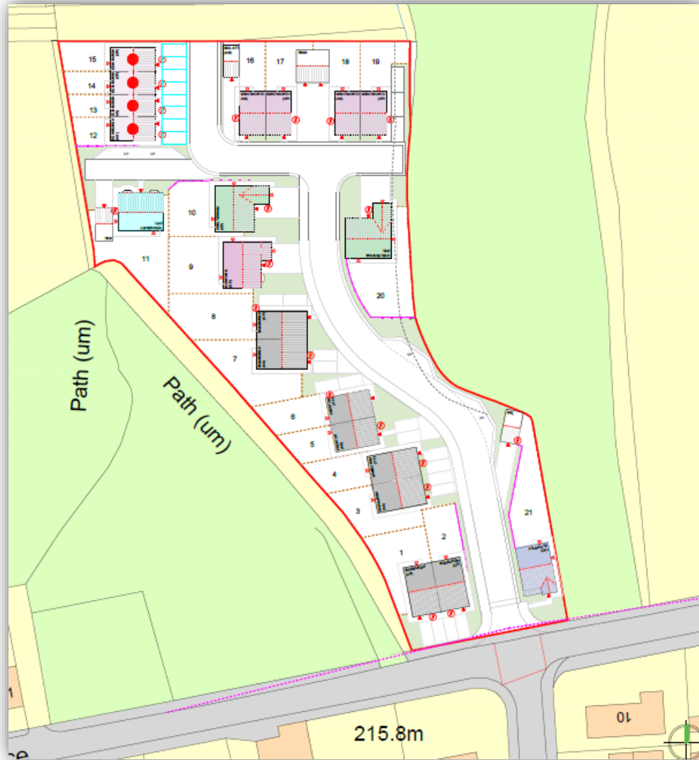
Figure 3: Site Layout Revision I. (Orion Homes Ltd.)

The proposed development comprises erection of 21 No. dwellings with means of access and associated works.