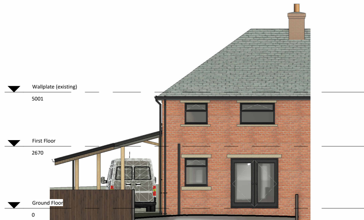
3 11 Rear Proposed 1 : 100