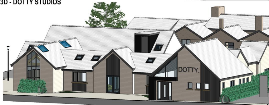
3D - ENTRANCE AREA