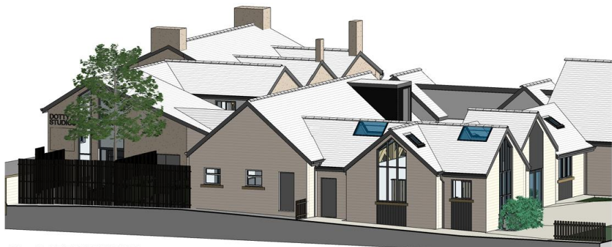
3D - DOTTY STUDIOS