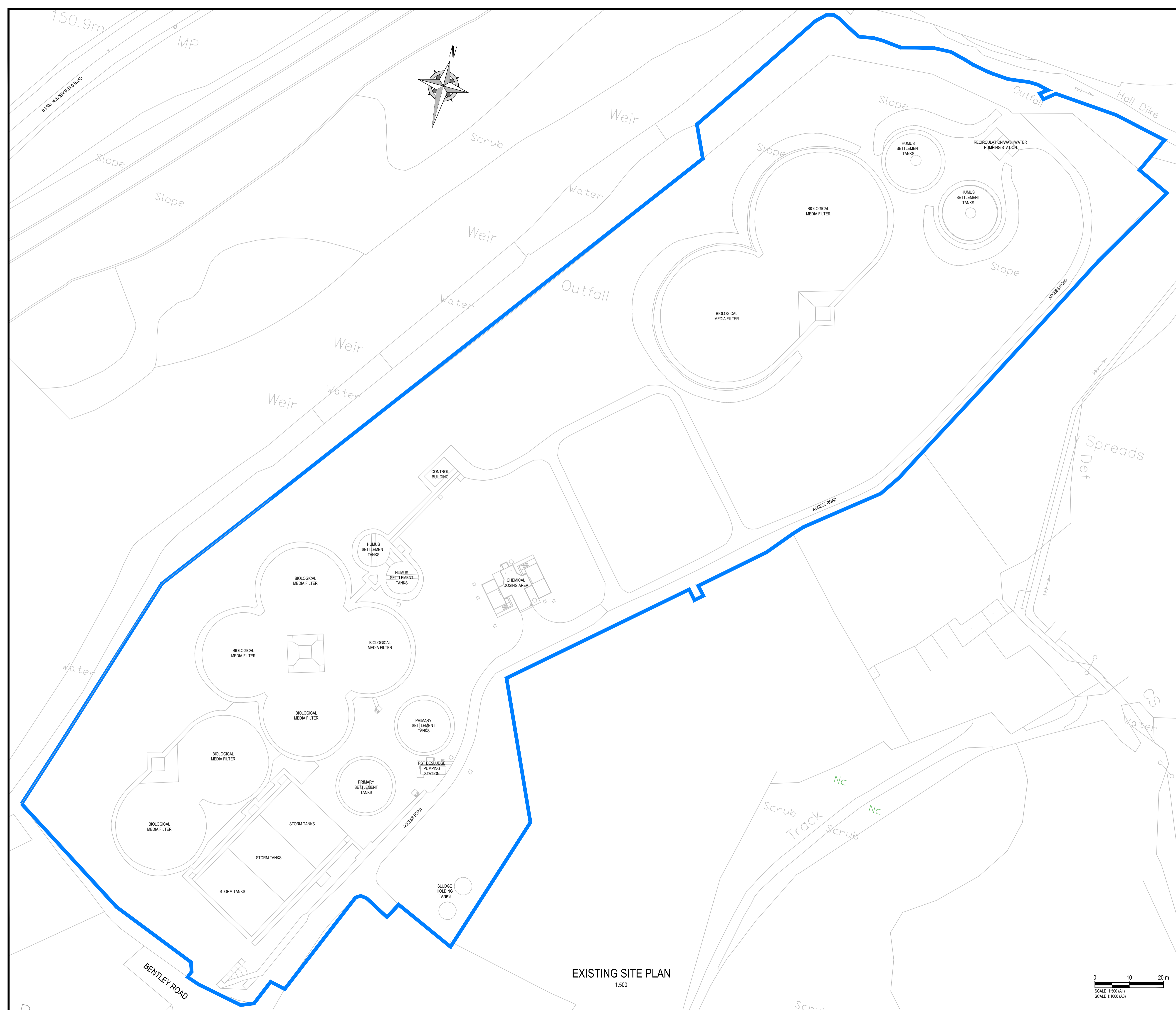
EXISTING SITE PLAN 1:500