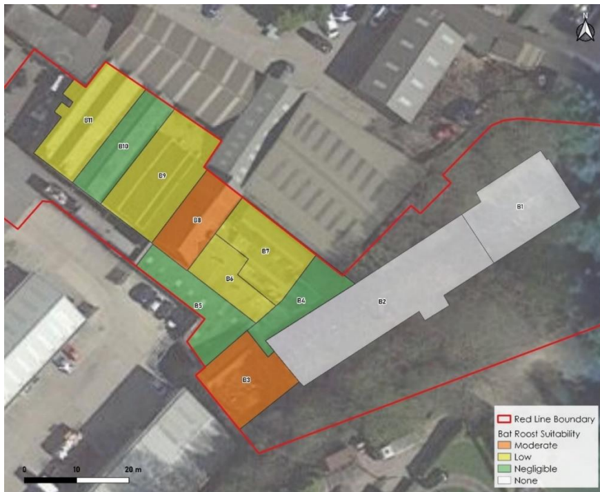
Figure 1 The surveyed buildings and suitability