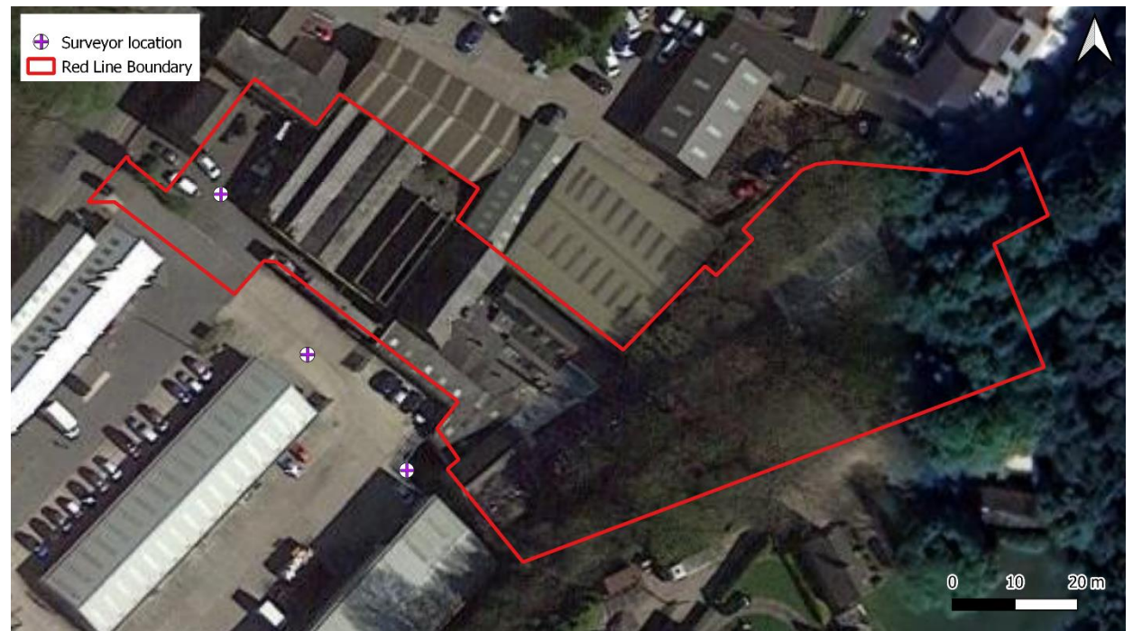
Figure 3 Summary of bat activity observed during emergence survey.