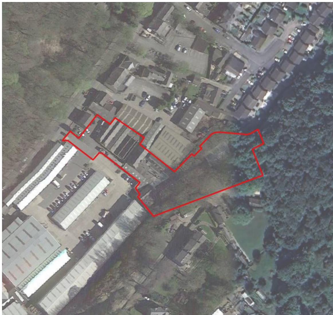
Figure 1 Extent of BNG assessment (red line boundary).