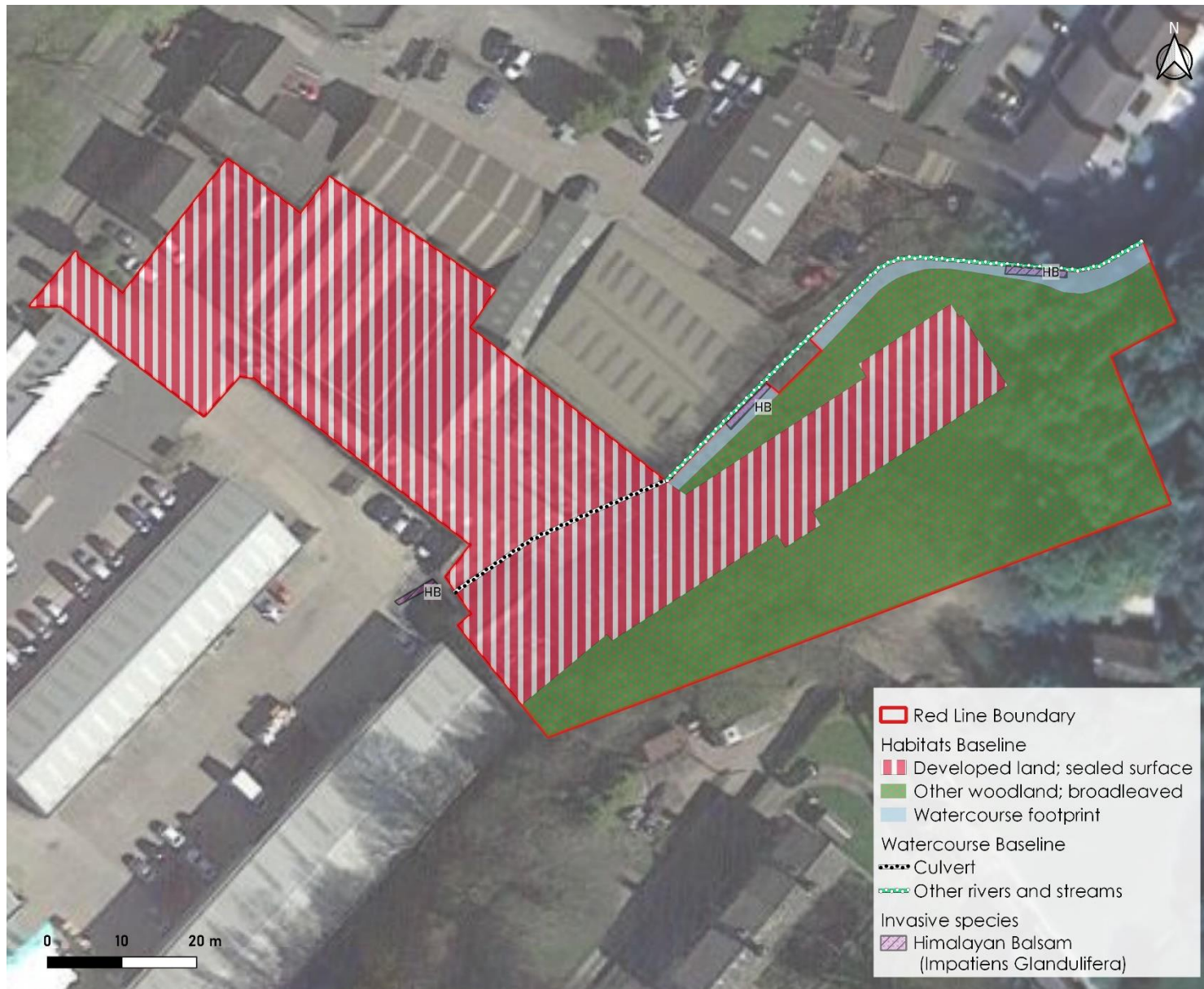
Figure 2 The Site's habitats assigned to types used in the Biodiversity Metric.