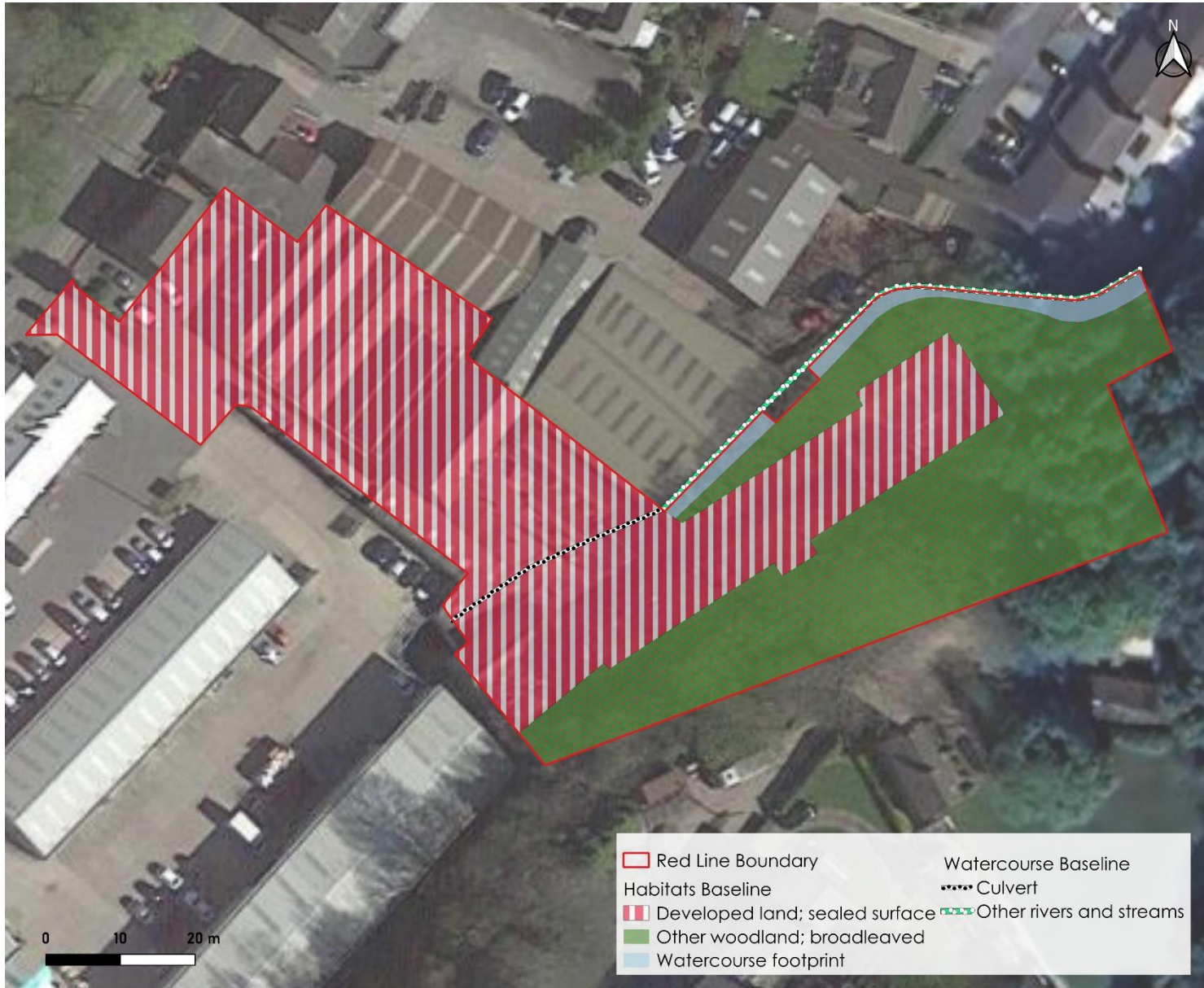
Figure 2 The Site's habitats assigned to types used in the Biodiversity Metric.