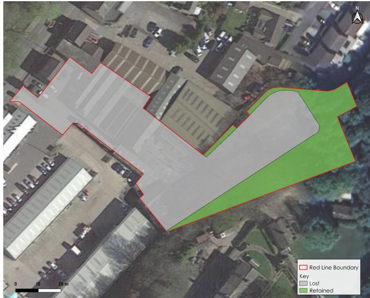
Figure 5 Habitat retention