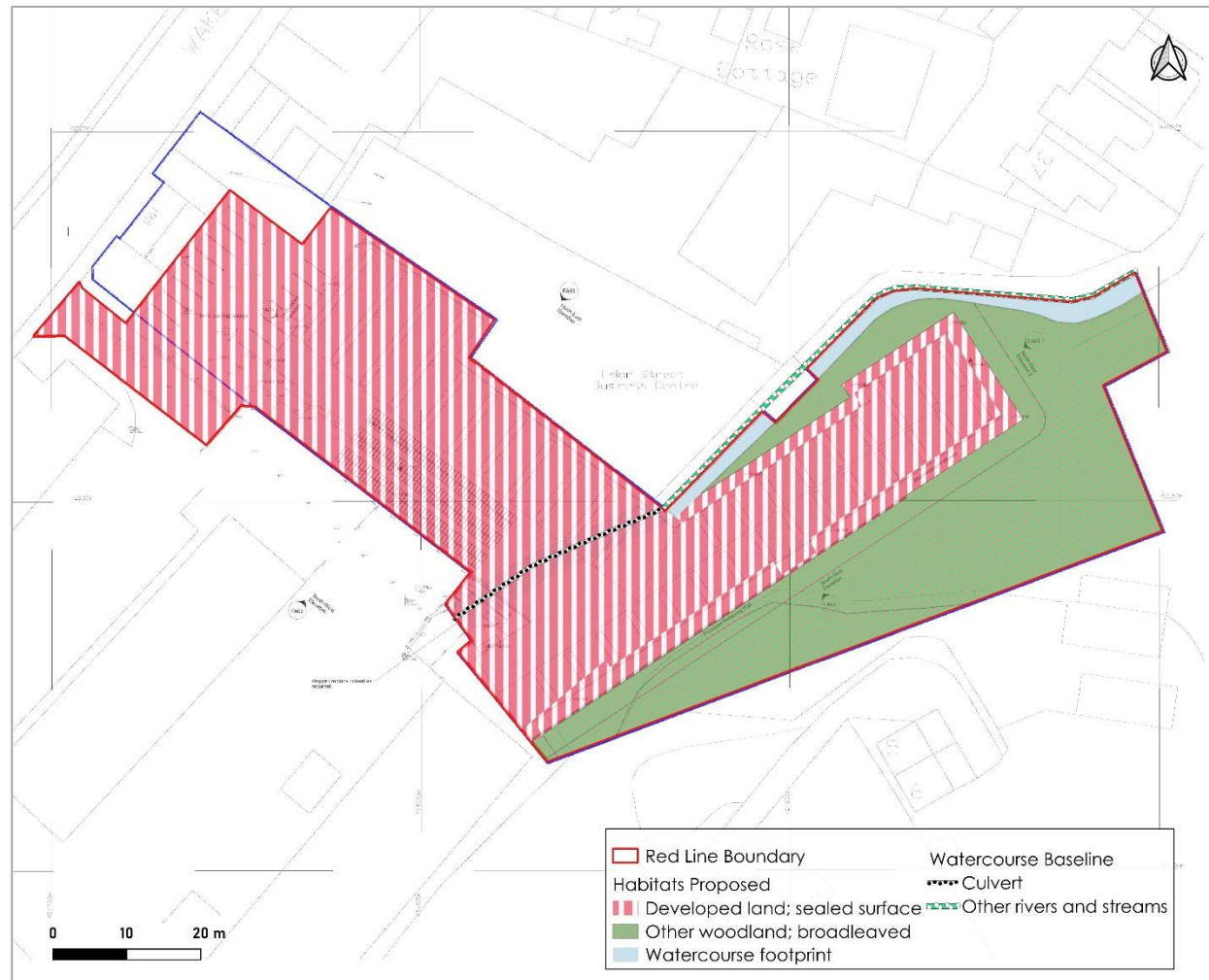
Figure 4 Post-development habitats.