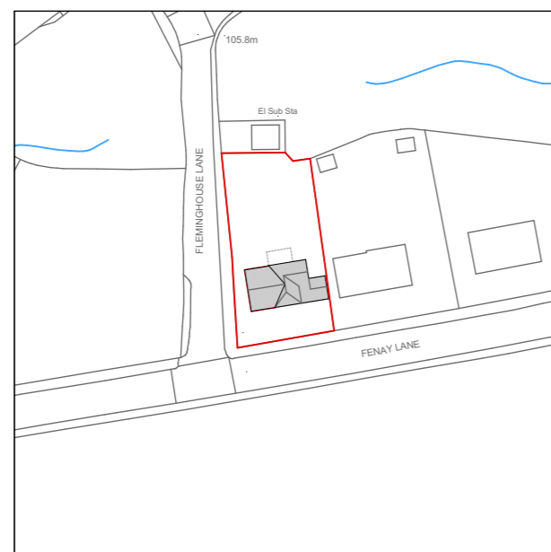
LOCATION PLAN @ 1 : 1250