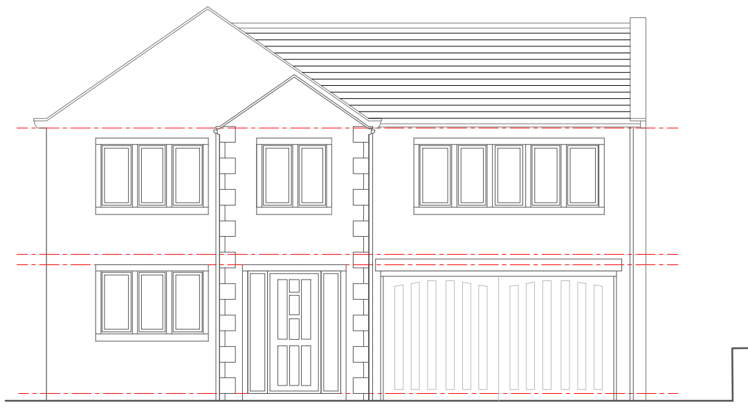
Front entrance first floor extension Standard window with ahslar surrounds