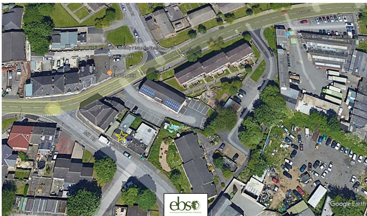
Fig 1. Site location