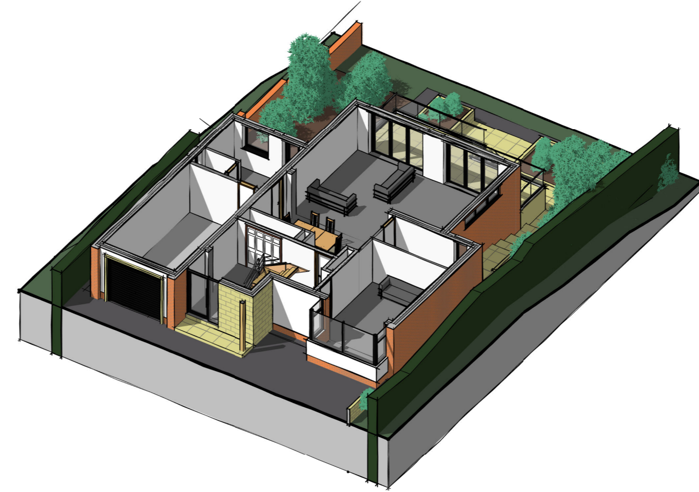
Ground Floor Isometric