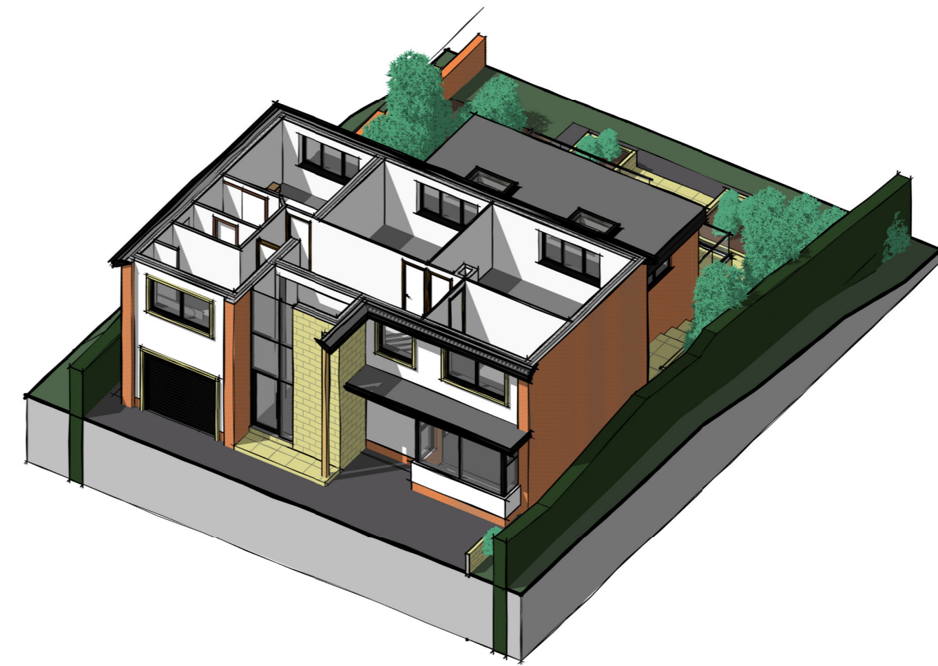
First Floor Isometric