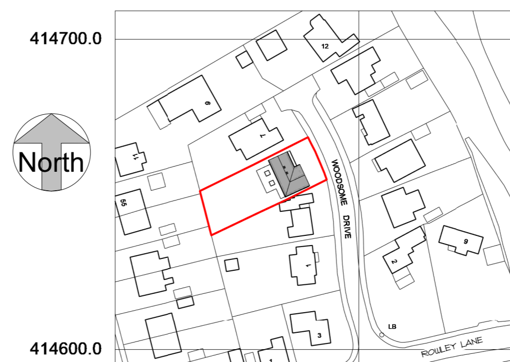
Site Location Plan 1: 1250