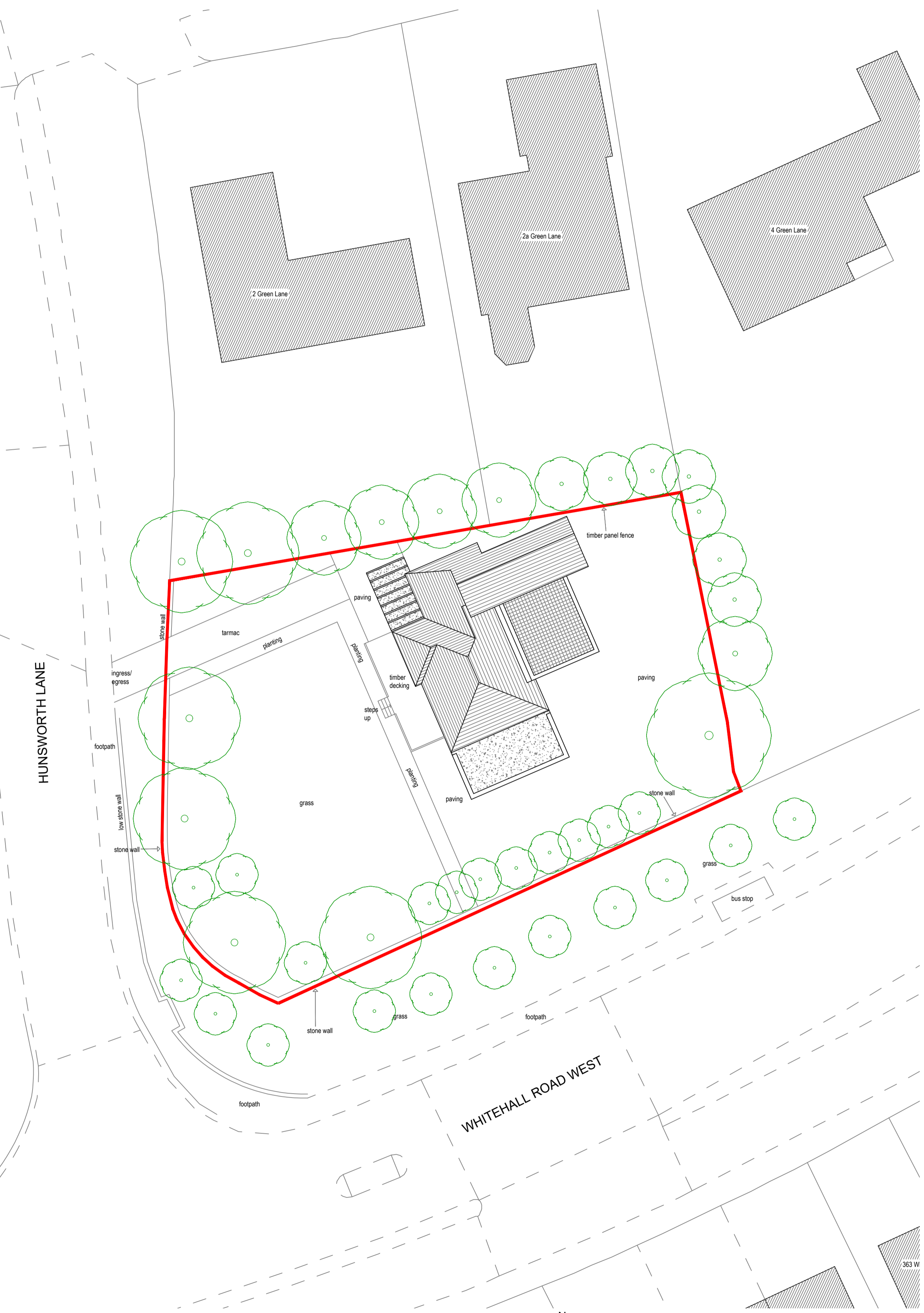
Existing Site & Roof Plan 1:200