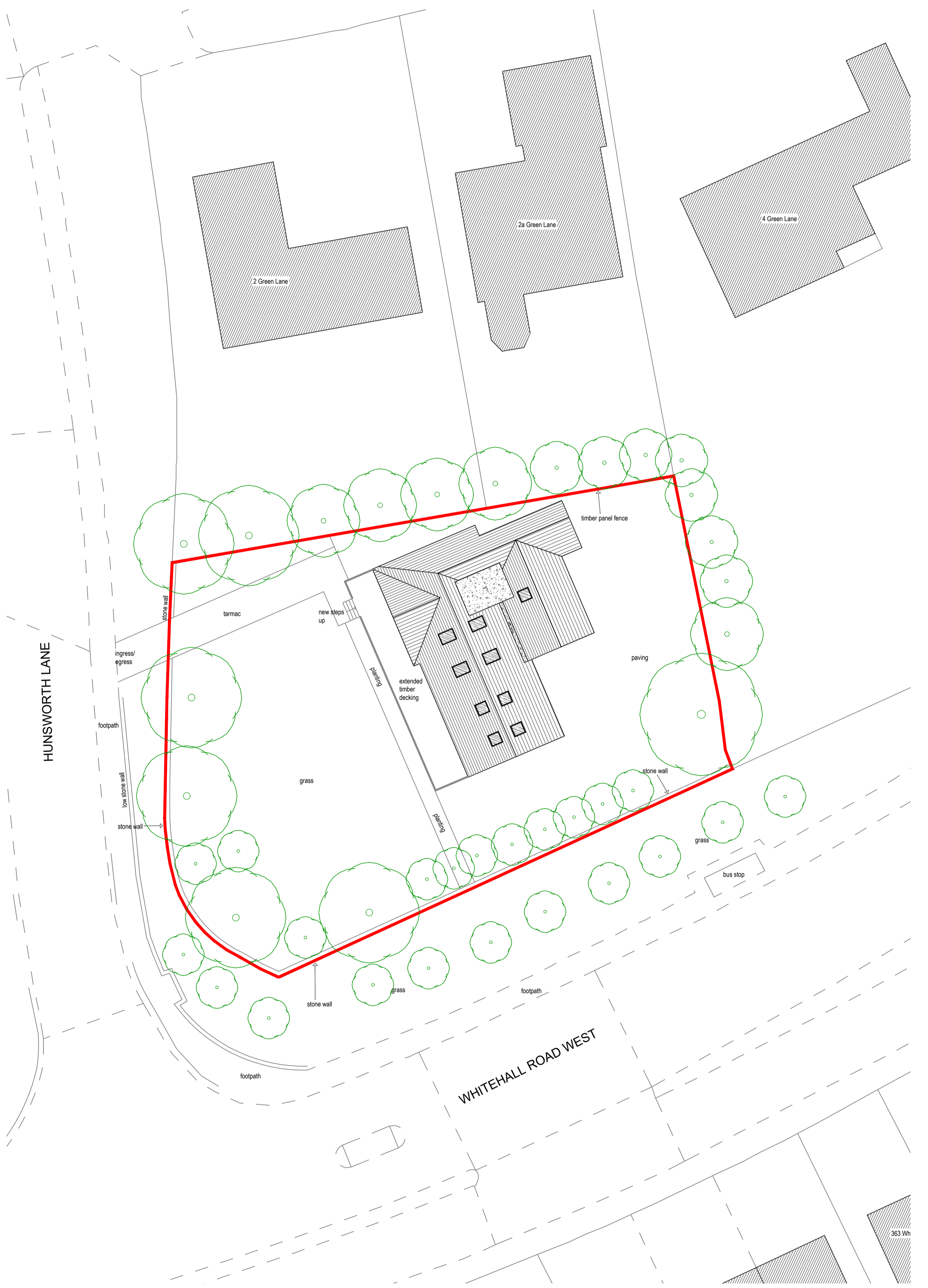
Proposed Site & Roof Plan 1:200