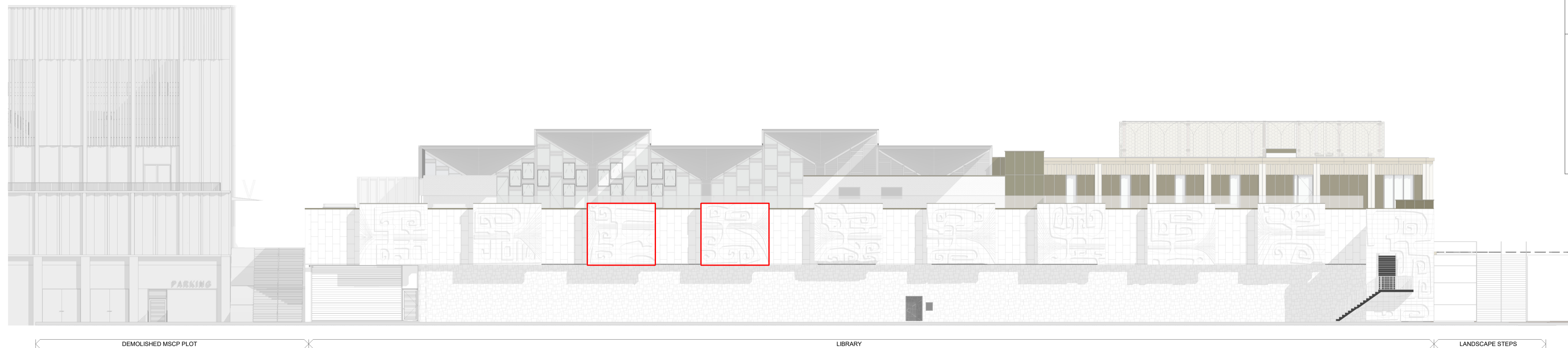
Key Elevation (East) 1 : 200