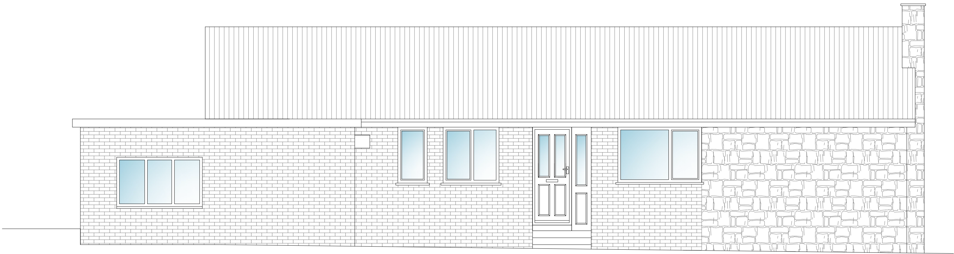
Existing Side Elevation- 1:50