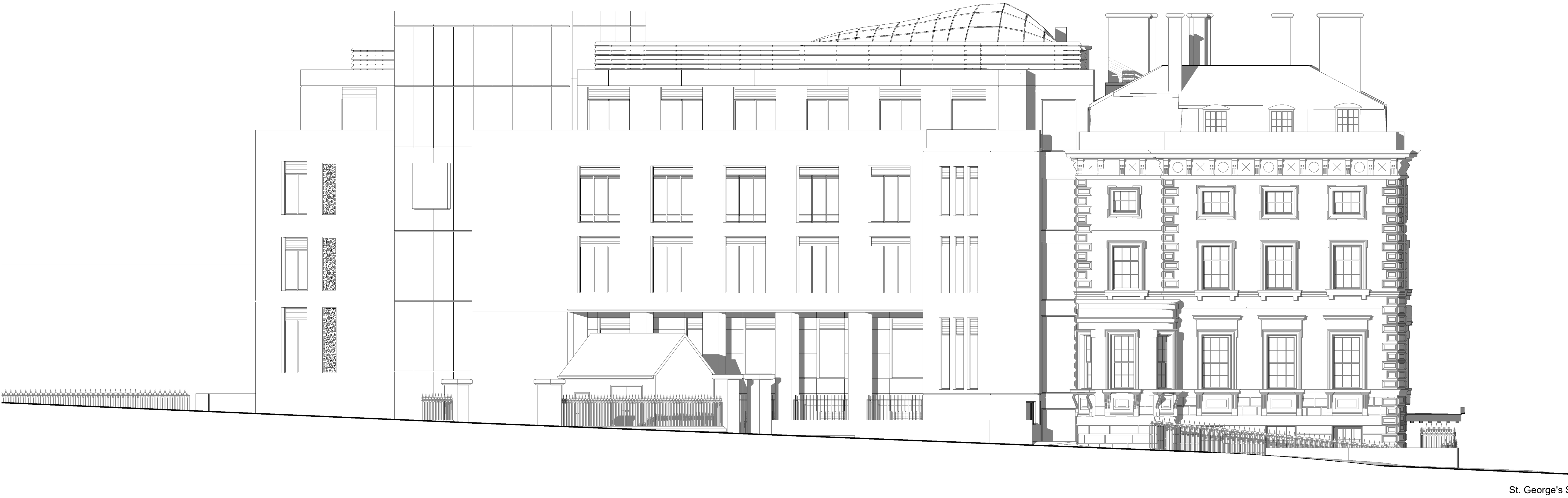
4) Proposed West Elevation B 1 : 100