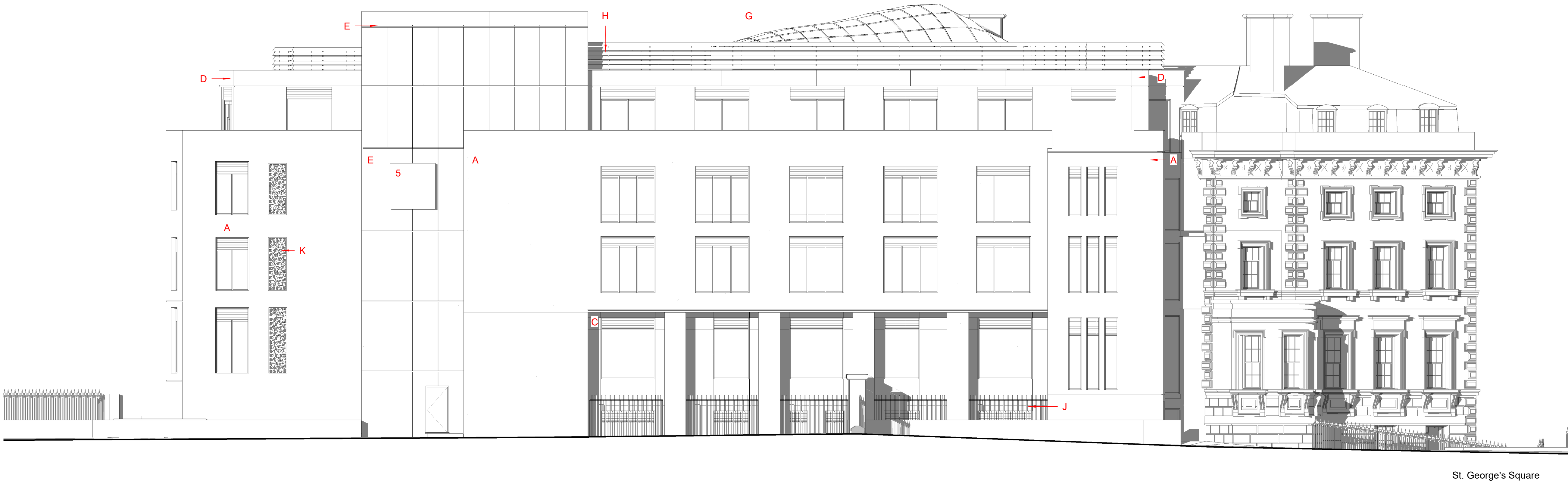
3) Proposed West Elevation A 1 : 100