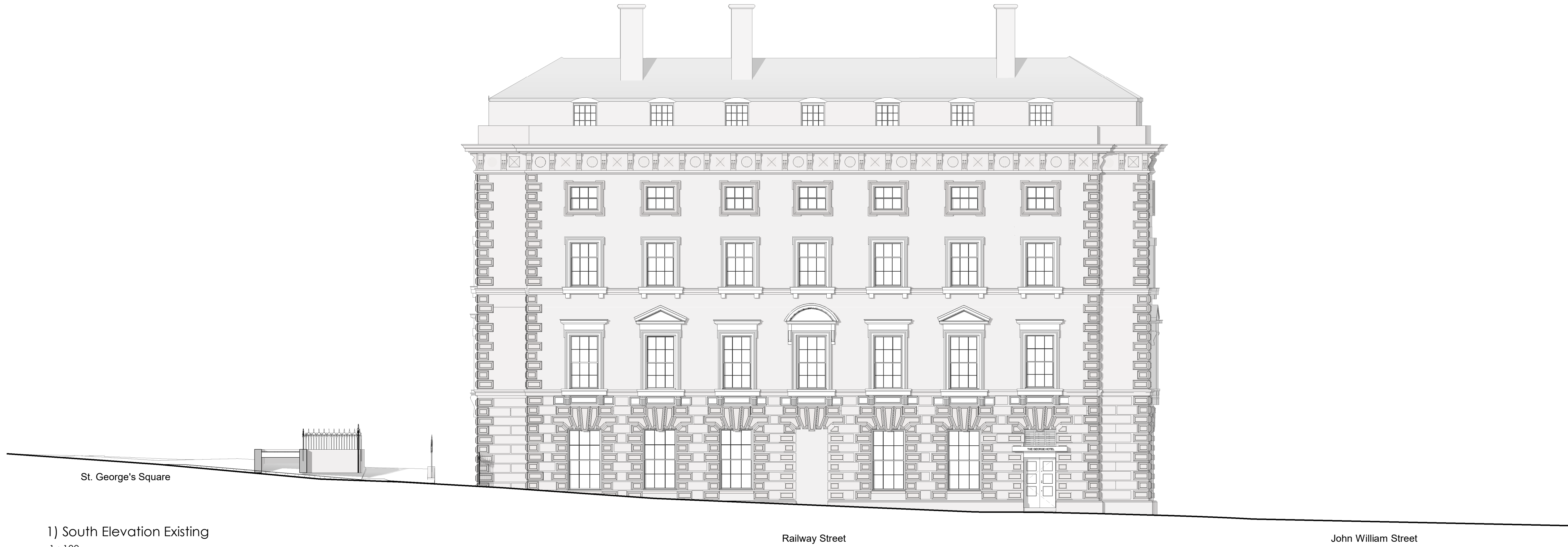
1) South Elevation Existing 1 : 100