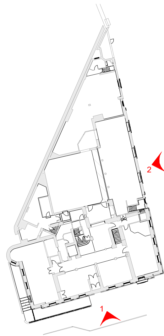
0031 Elevation Key 1 : 500