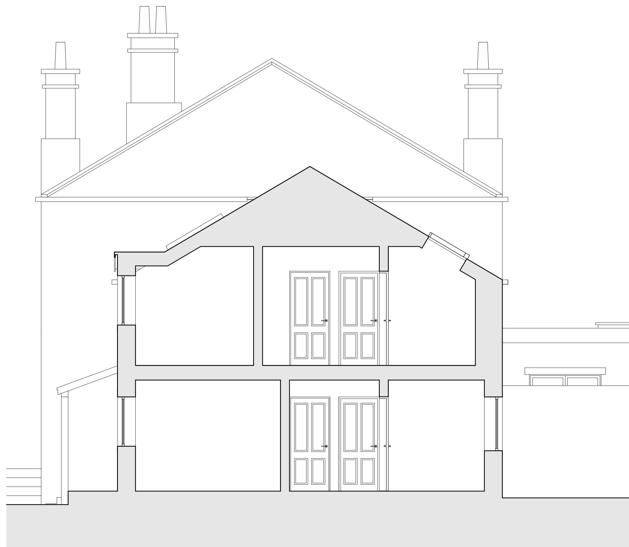
Section AA - 1:50