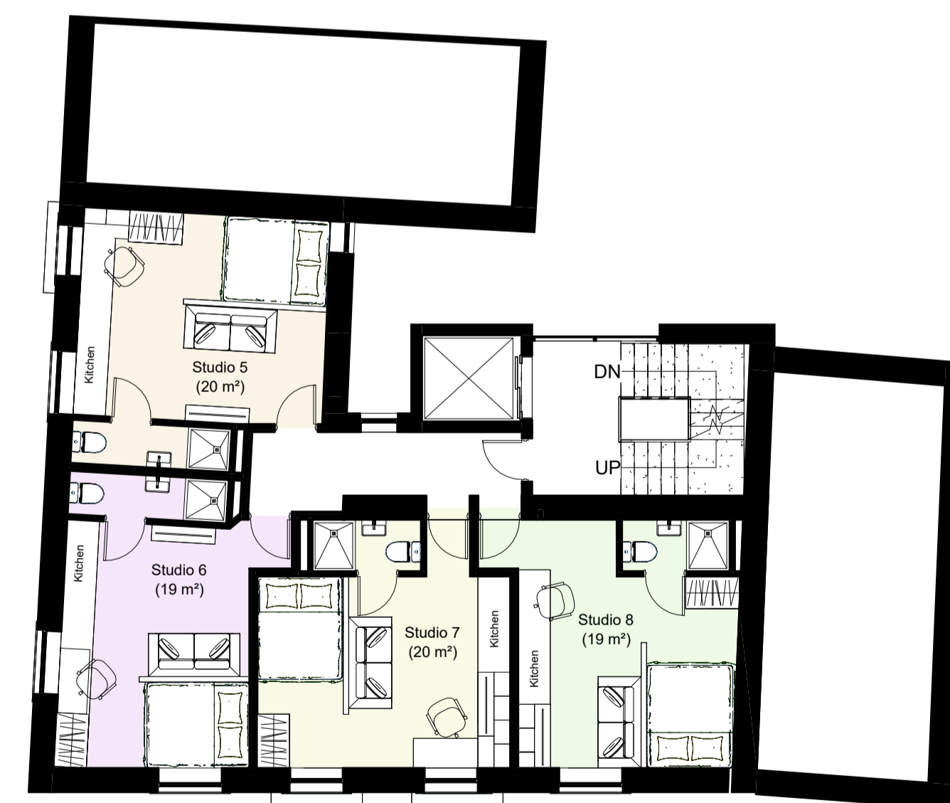
1 Proposed First Floor Plan 1 : 100