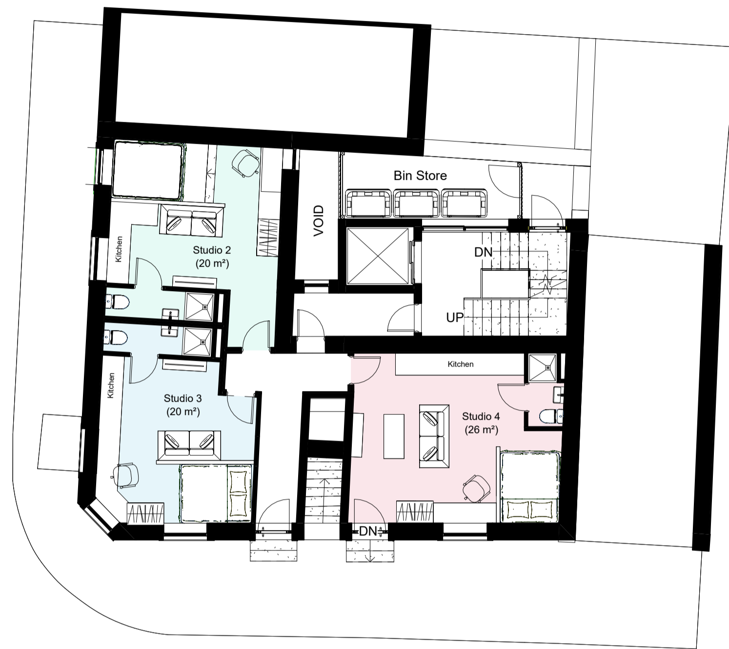
0 Proposed Ground Floor Plan 1 : 100