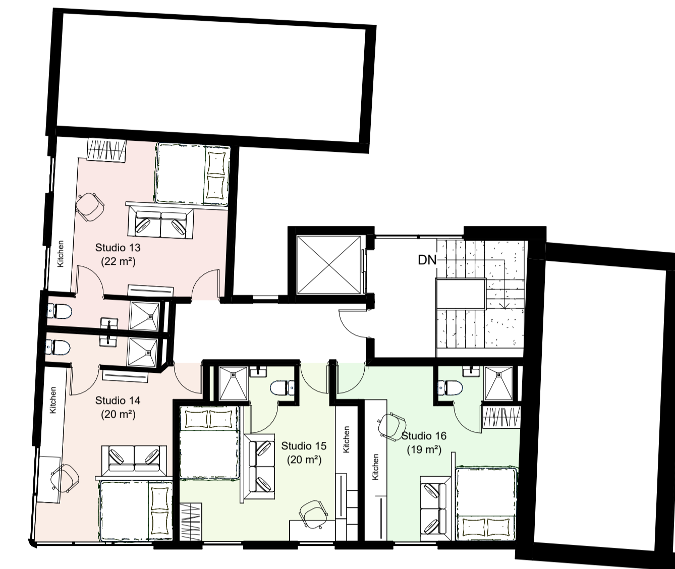
3 Proposed Third Floor Plan 1 : 100