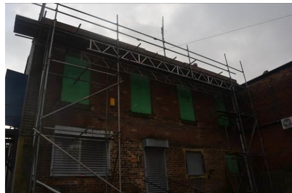
Figs. 1 & 2 Rowlands Pharmacy, Cleckheaton

The building was set on a moderate plot with front and rear car parking, road access. Buildings and roads dominated surrounding habitats.