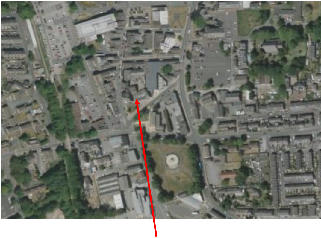
Rowlands Pharmacy, Cleckheaton