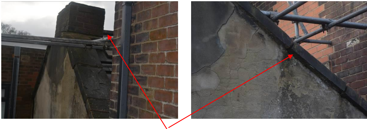
Figs. 3 & 4 External roof detail – narrow gaps along eaves soffit (arrowed)

Externally, the inspection revealed the only features present were gaps along the ridge where mortar had weathered out, and mortar gaps at a gable end (Figs. 3 and 4 - arrowed).