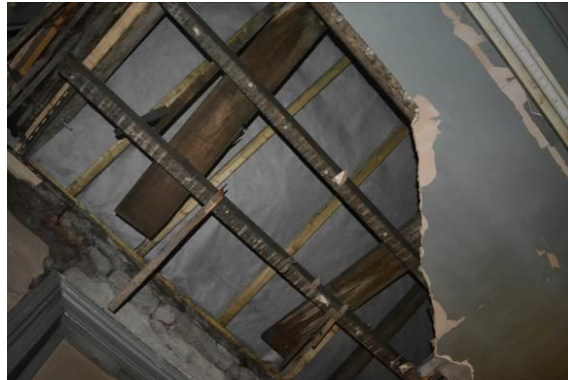
Fig. 8 Broken ceiling revealed roof void was lined with BRM

Internally, the inspection revealed no accessible roof voids were present, with the ceilings high up to the voids within the pitched roof buildings. The only portion of roof visible was through a portion of broken ceiling (Fig. 8), which revealed a breathable roof membrane lined the void.