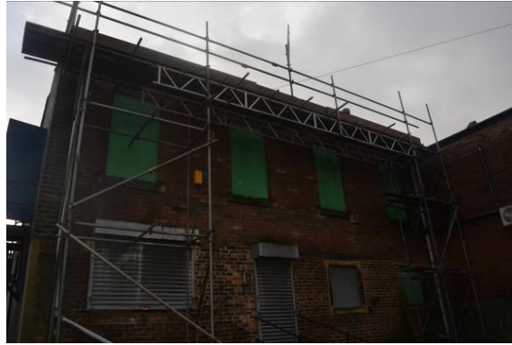
Fig. 7 Doors and windows fitting within apertures

Additionally, all of windows and doors were fully sealed and tightly fitting to the brickwork, whilst of the external brickwork and stonework itself was in good condition throughout (Fig. 7).