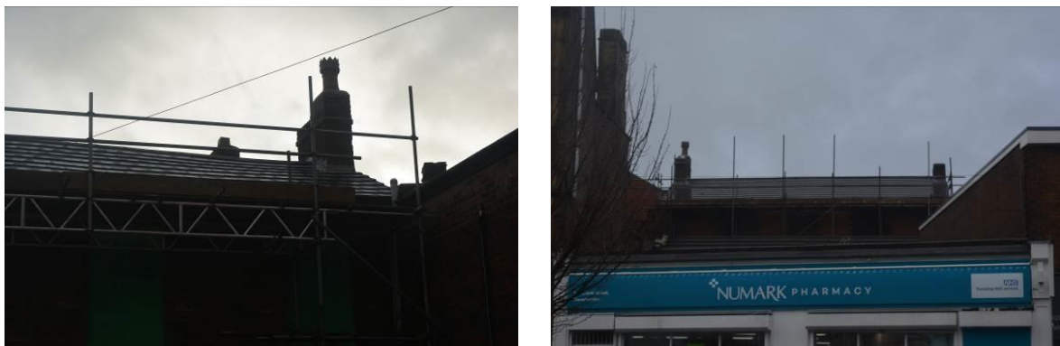
Figs. 5 & 6 Roof detail

The inspection revealed no further external features; the roofs were in good condition throughout, with the pitched tiles and main ridge all tightly fitting, whilst the flat roof was all fully sealed (Figs. 5 and 6).