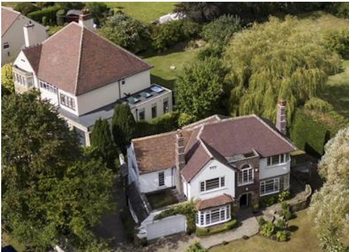
Figure 3: Demonstrating previous extension with windows facing into my back garden. Furthermore, the tree beside this previous extension alongside which the new back extension is proposed.

Again, the proposed extension to the back lies very close to our fence where another tree stands (in addition to the willow). I am concerned about whether this could also be damaged in the process of digging the foundations. The previous extension at the back already has windows facing into our garden impeding privacy. A further extension to the back will add further to the view of our garden from 4 Dorchester Road. See figures 1, 2, 3 & 4.