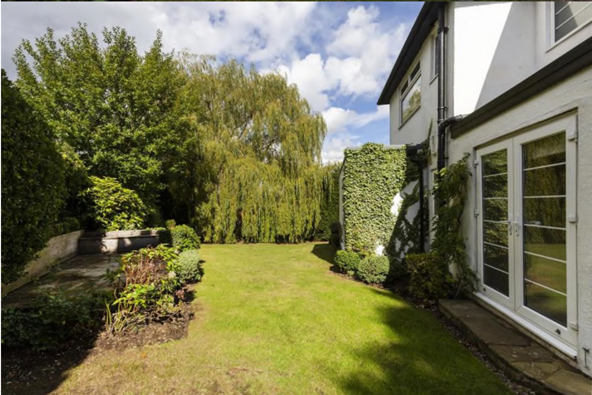
Figure 2: Pictures demonstrating beauty of trees in back garden at threat from proposals.