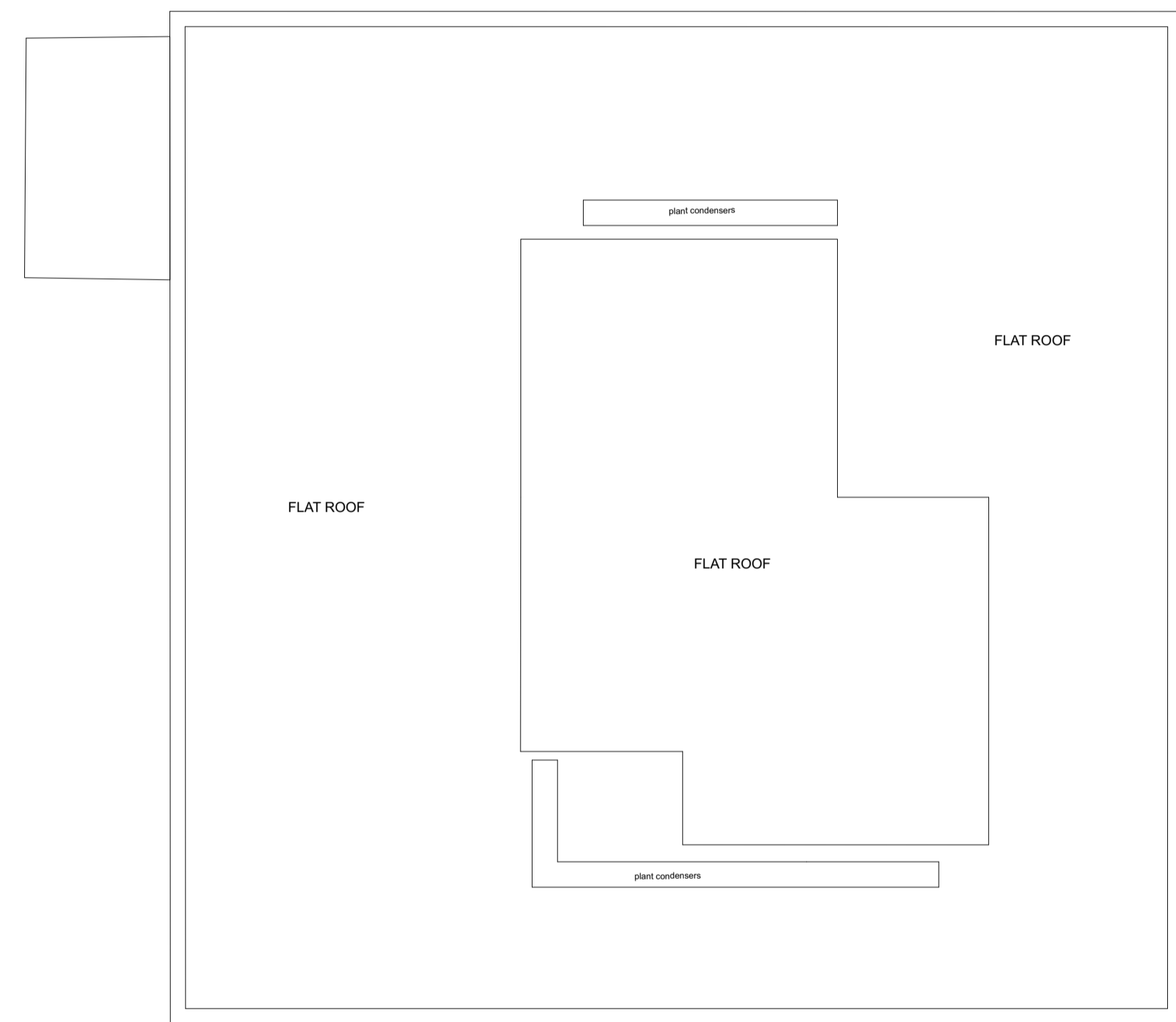
EXISTING ROOF PLAN