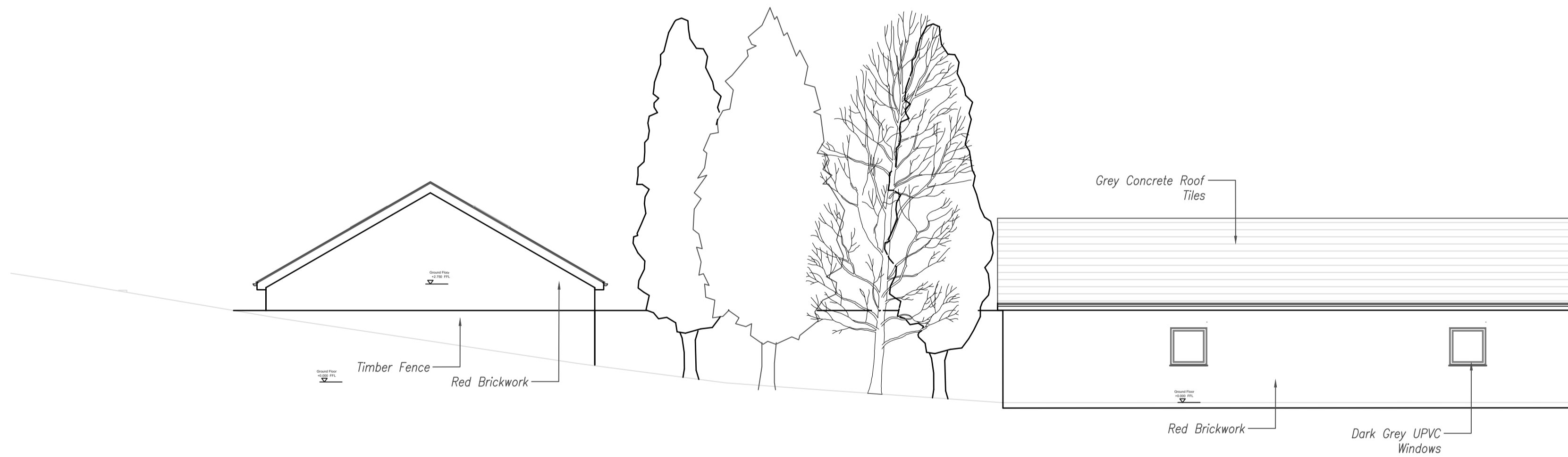
Block B Back Elevation (West) Scale 1:100