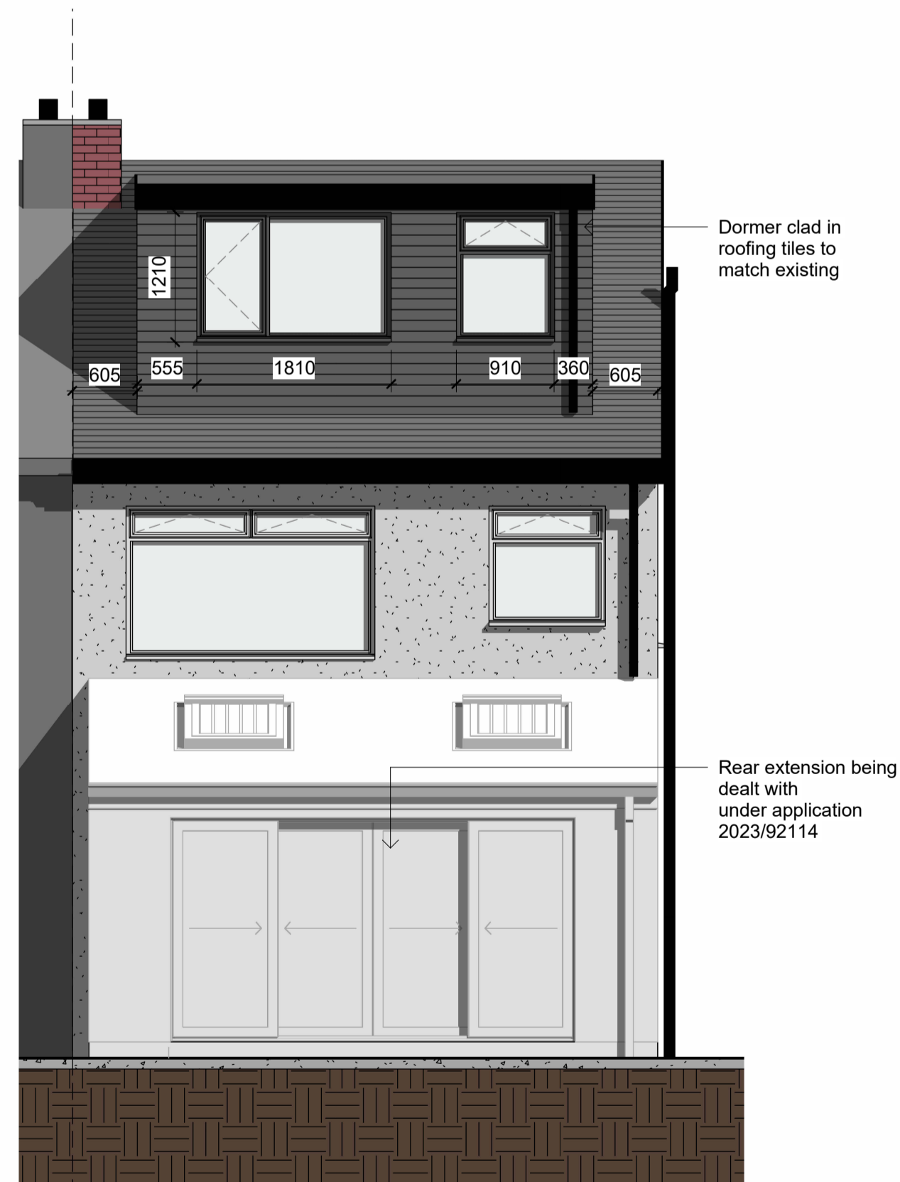
Proposed Rear Elevation 1 : 50