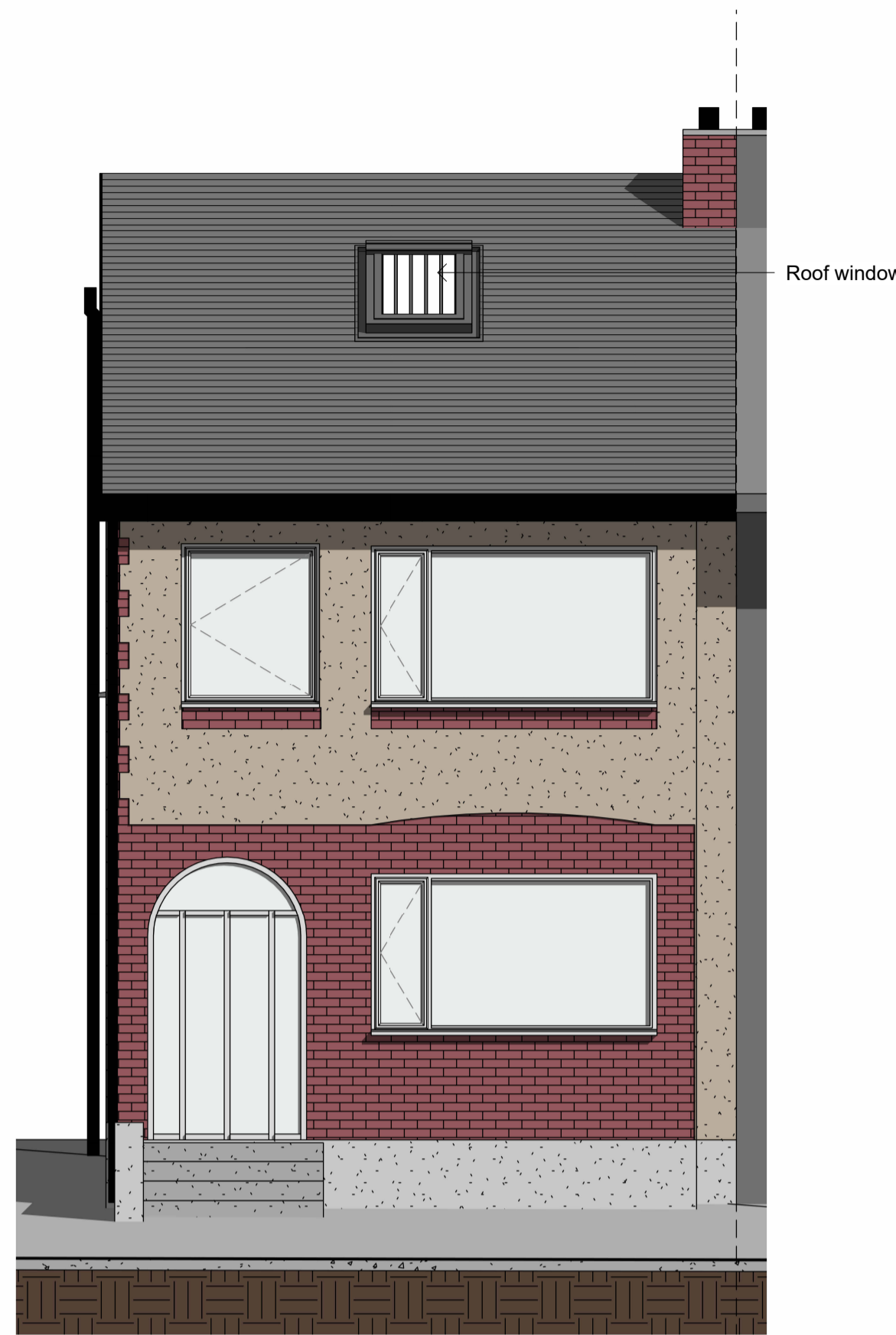
Proposed Front Elevation 1 : 50

Discrepancies Any discrepancy, discovered by the Contractor, between the structural drawings and specification or between the drawings/specification and the site, must be brought to the notice of the Client for clarification and instruction immediately any such discrepancy becomes apparent.