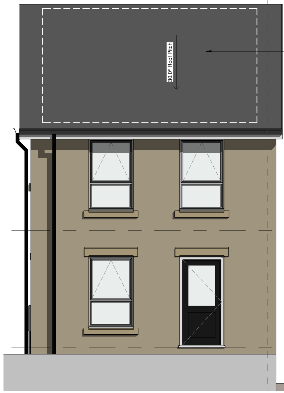
Rear Elevation 1 : 50