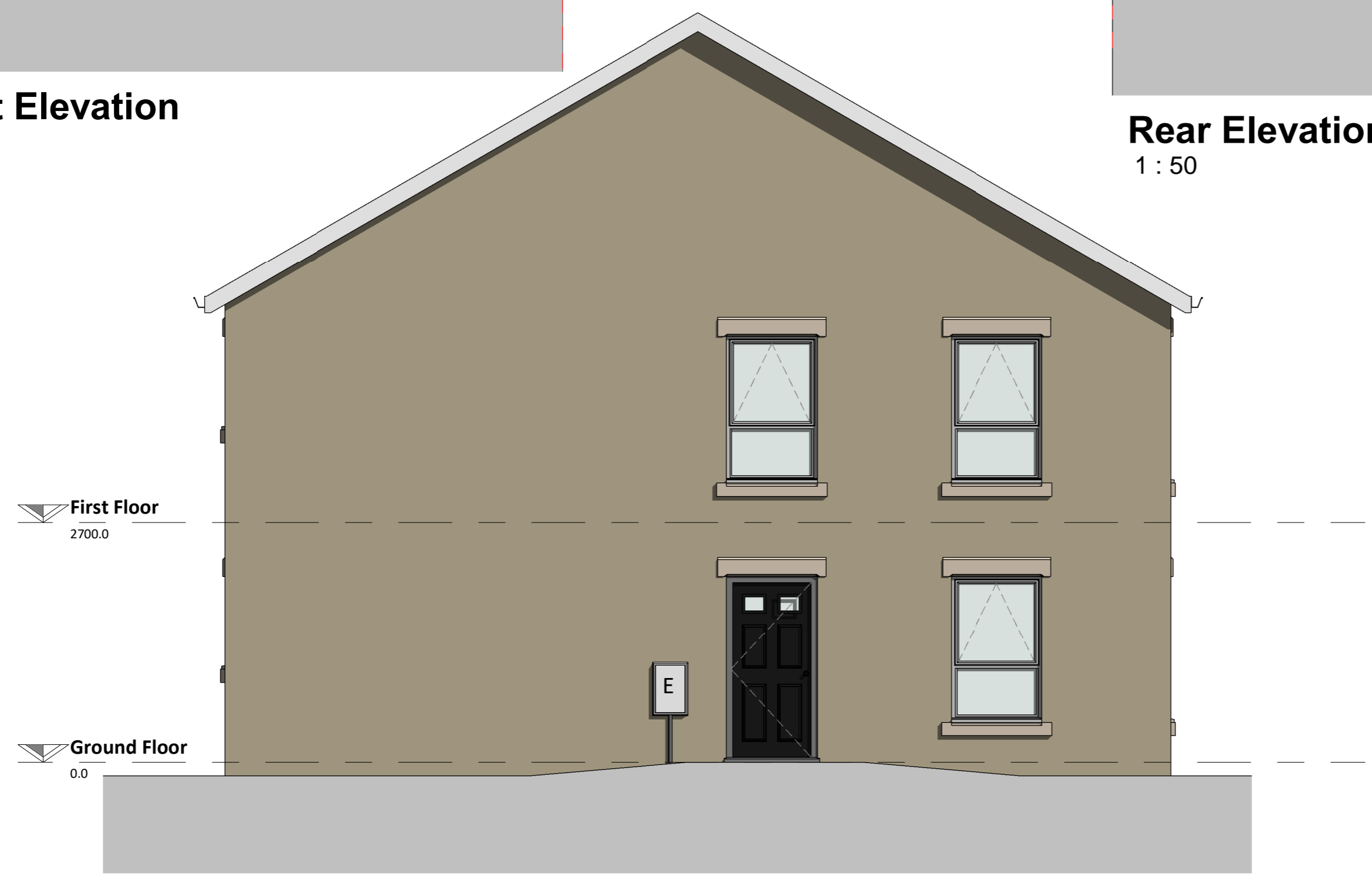
Gable Elevation 1 : 50