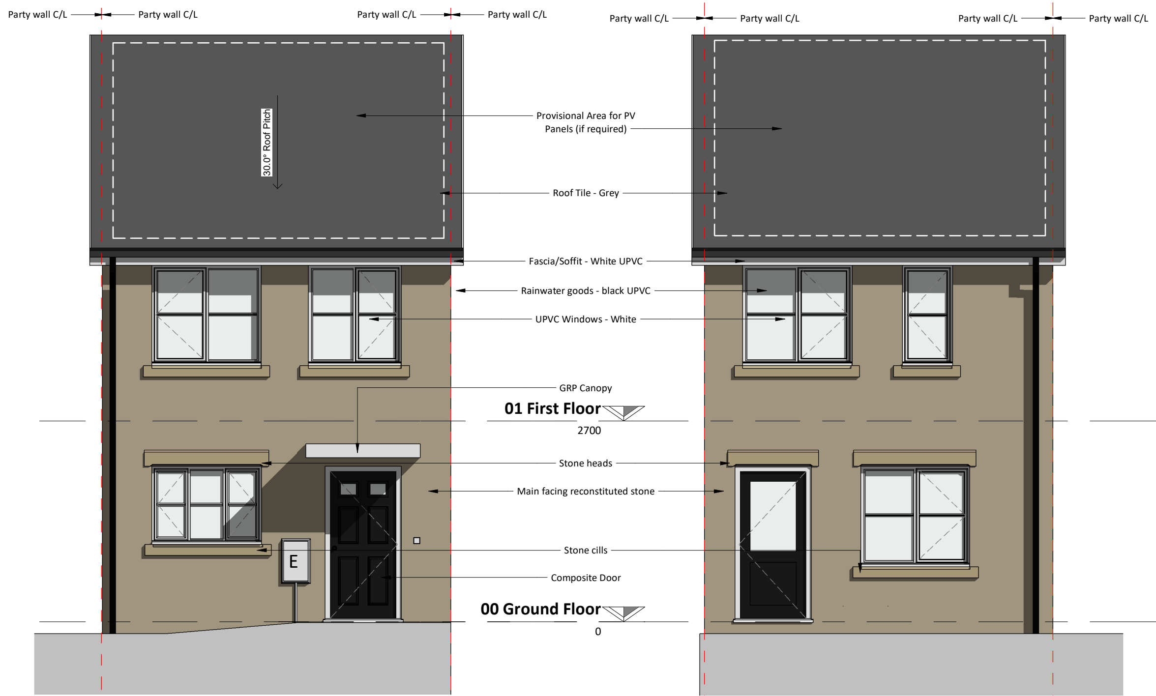
Front Elevation 1 : 50

All materials and workmanship to be in accordance with the current British Standards and codes of practice.