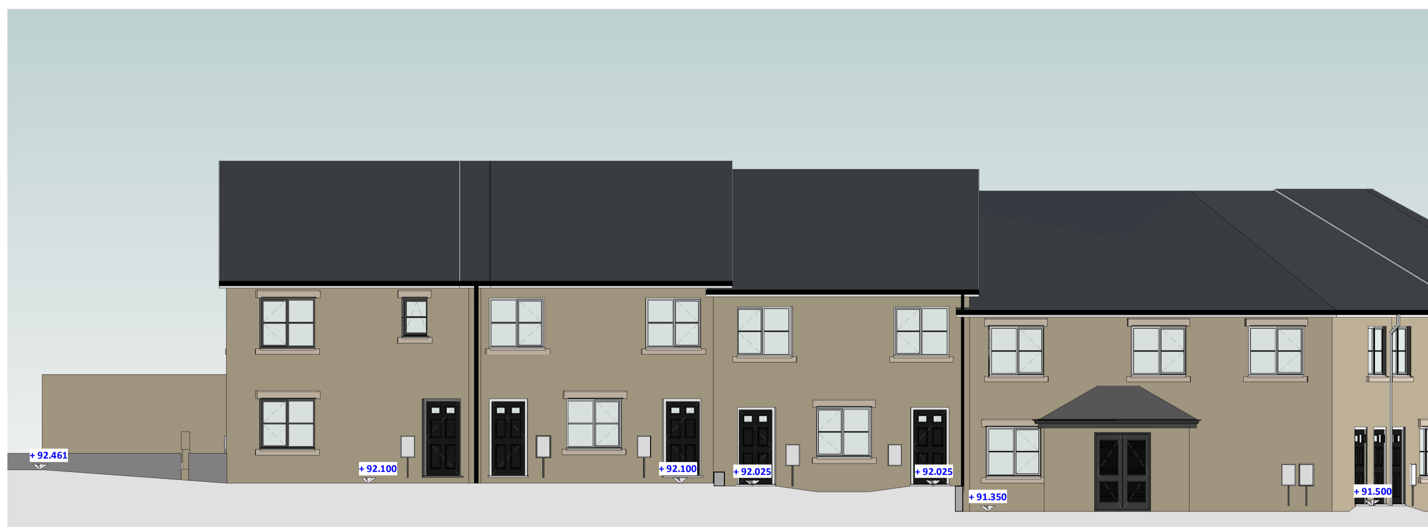
Street Elevation - George Street 1 : 100