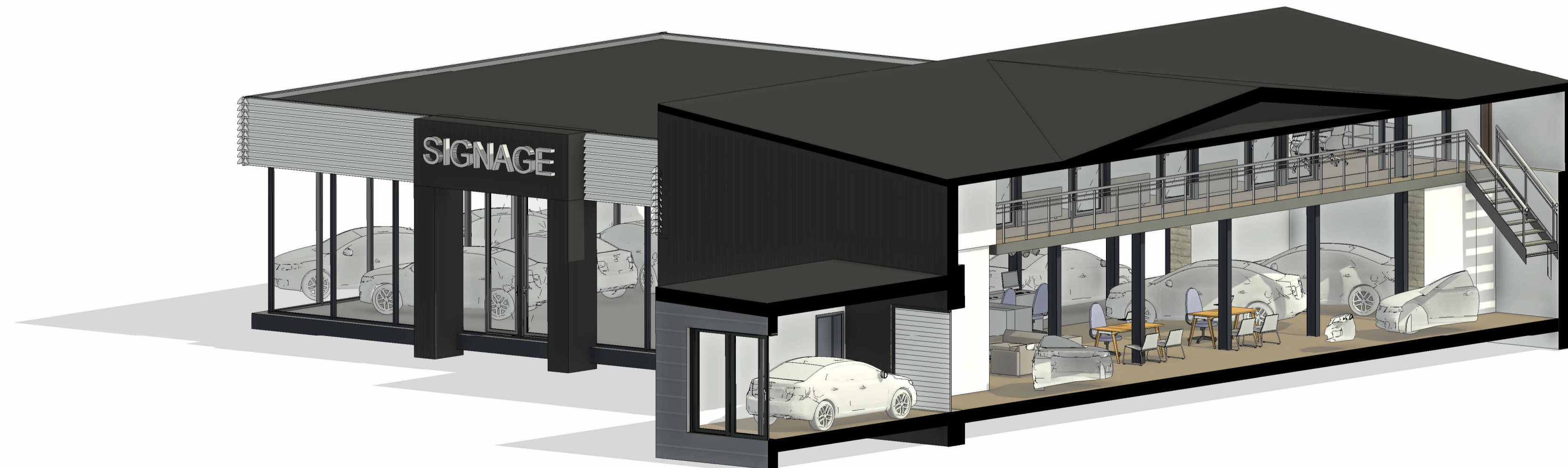
3D Section 3