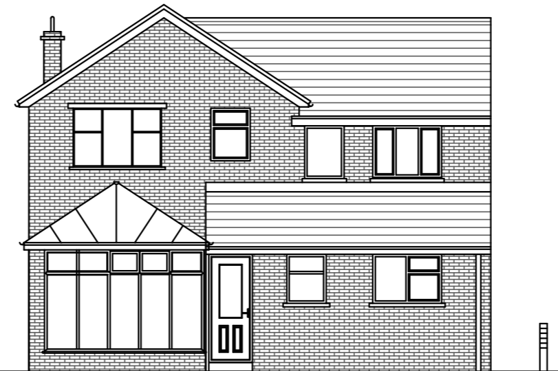
Existing South View