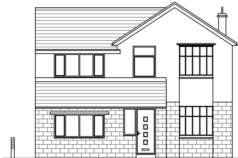
Existing North View