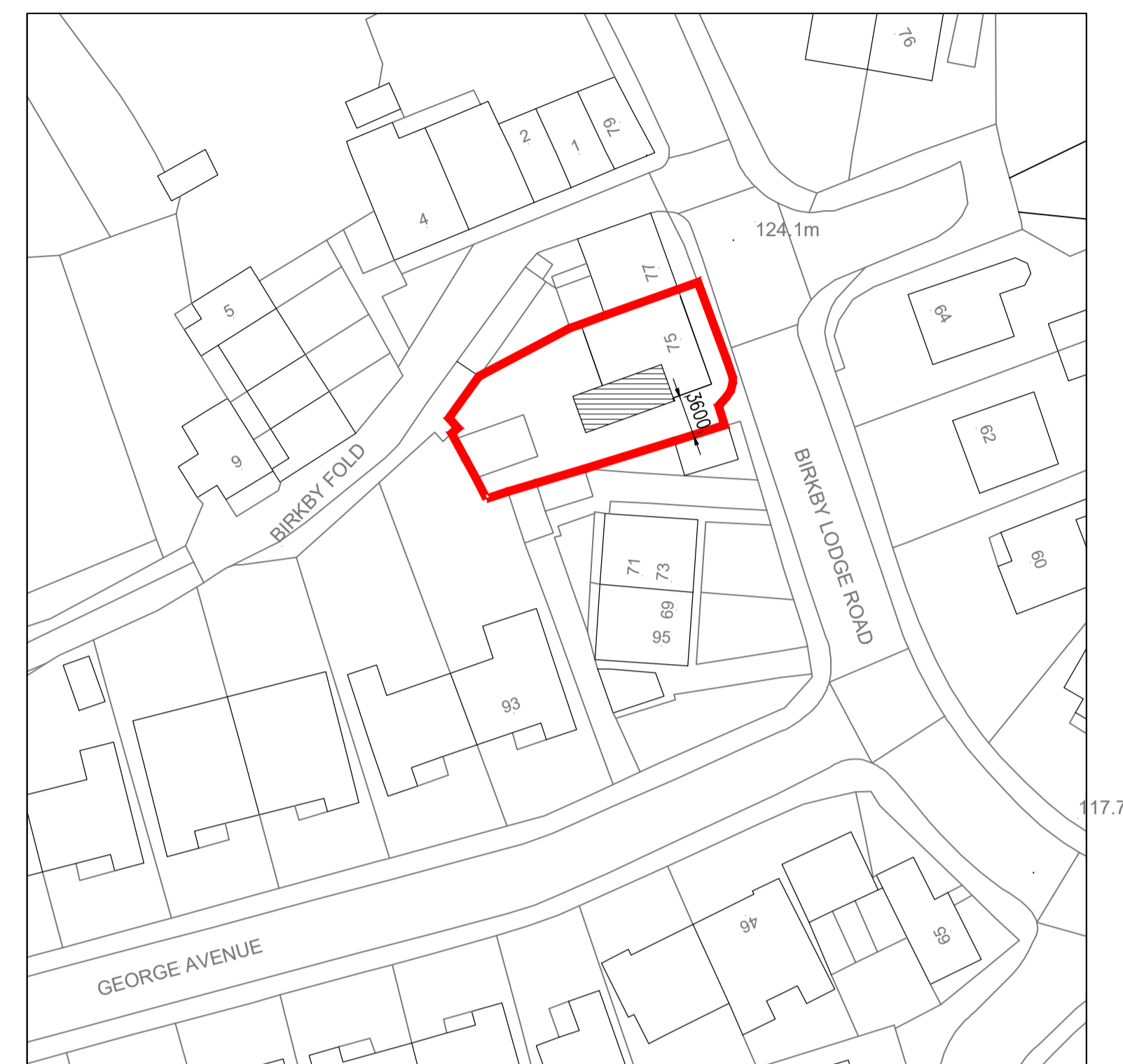
PROPOSED SITE/BLOCK PLAN 1:500