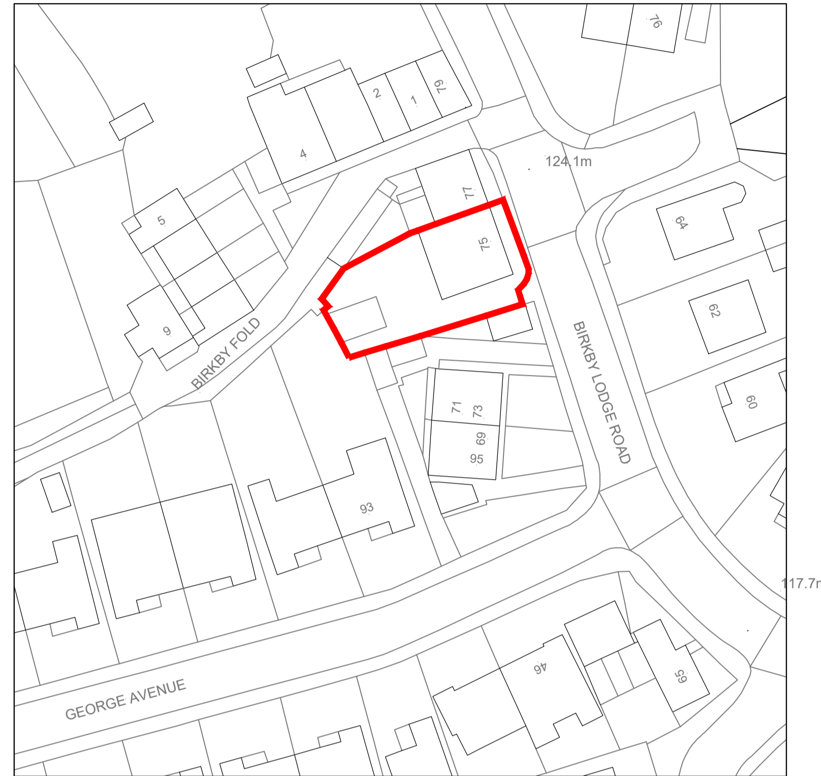
EXISTING SITE/BLOCK PLAN 1:500

©Crown Copyright and database rights 2021 OS Licence no. 100041041