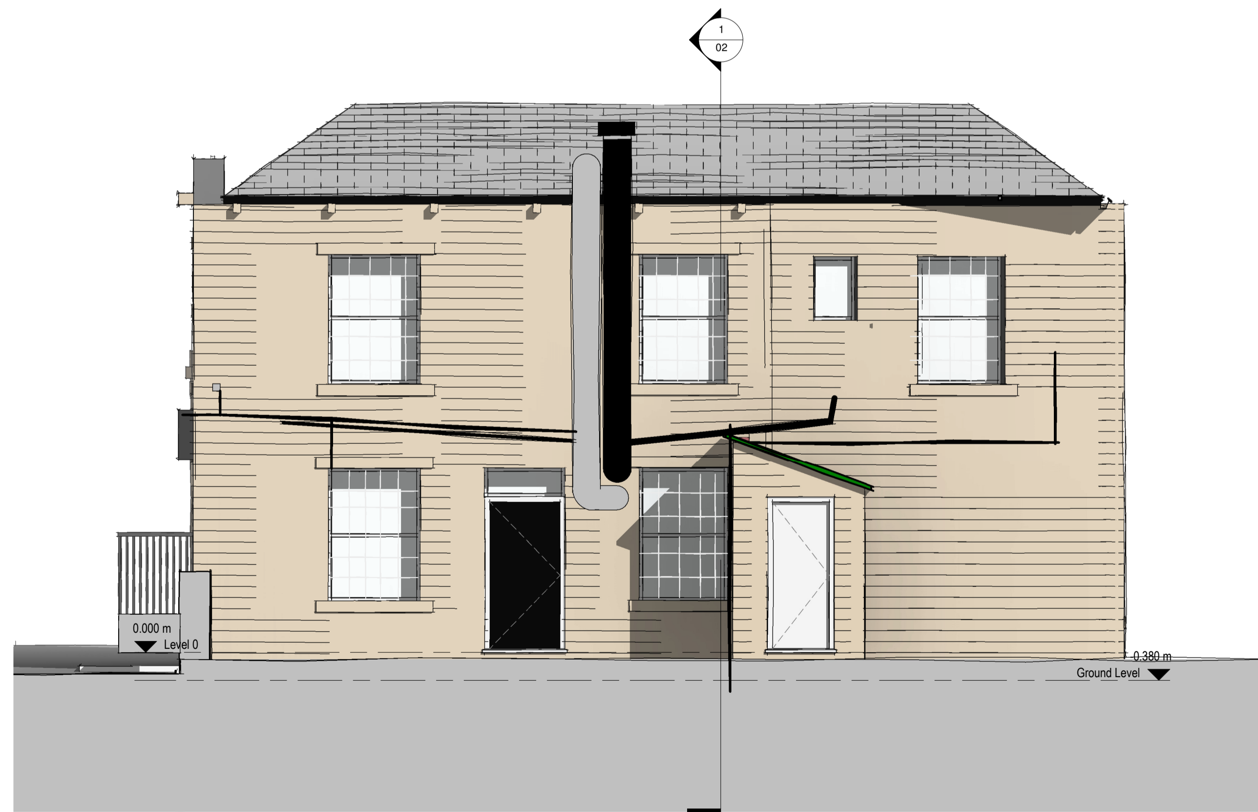
3 Side Elevation 1 : 50