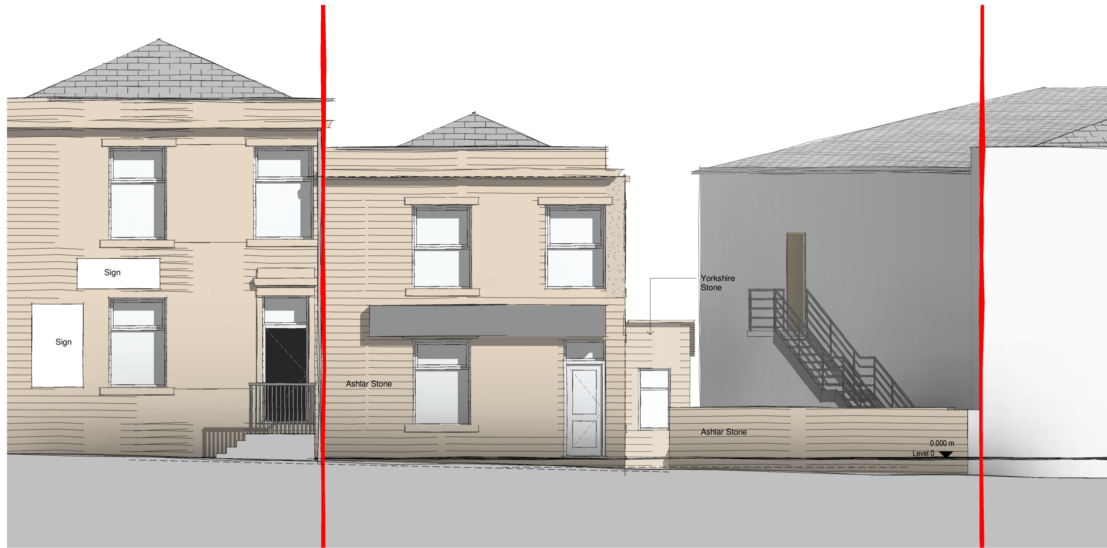
2 Existing Front Elevation 1 : 50