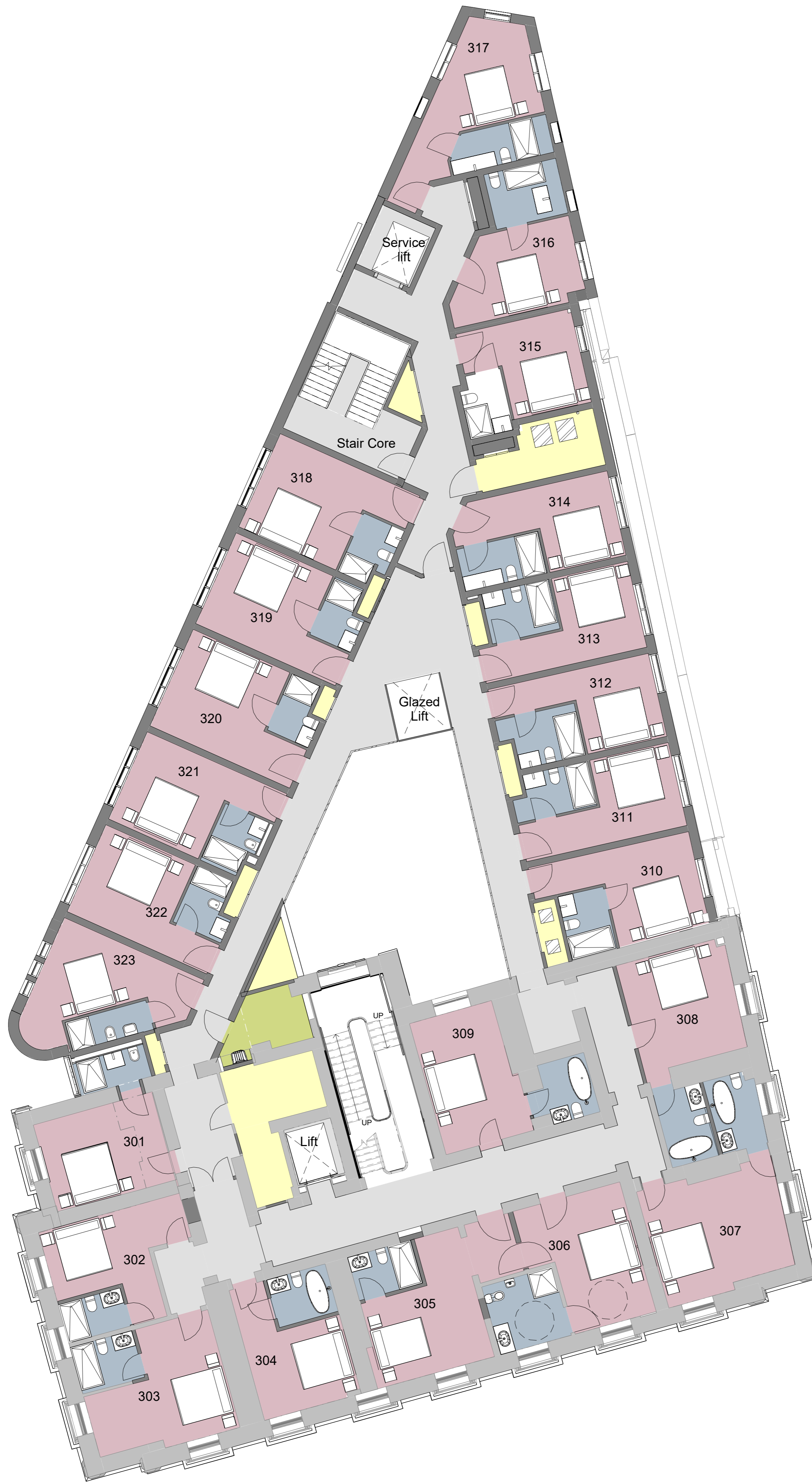
Proposed Level 03 Plan 1 : 100

— Denotes Existing Wall — Denotes Proposed Wall