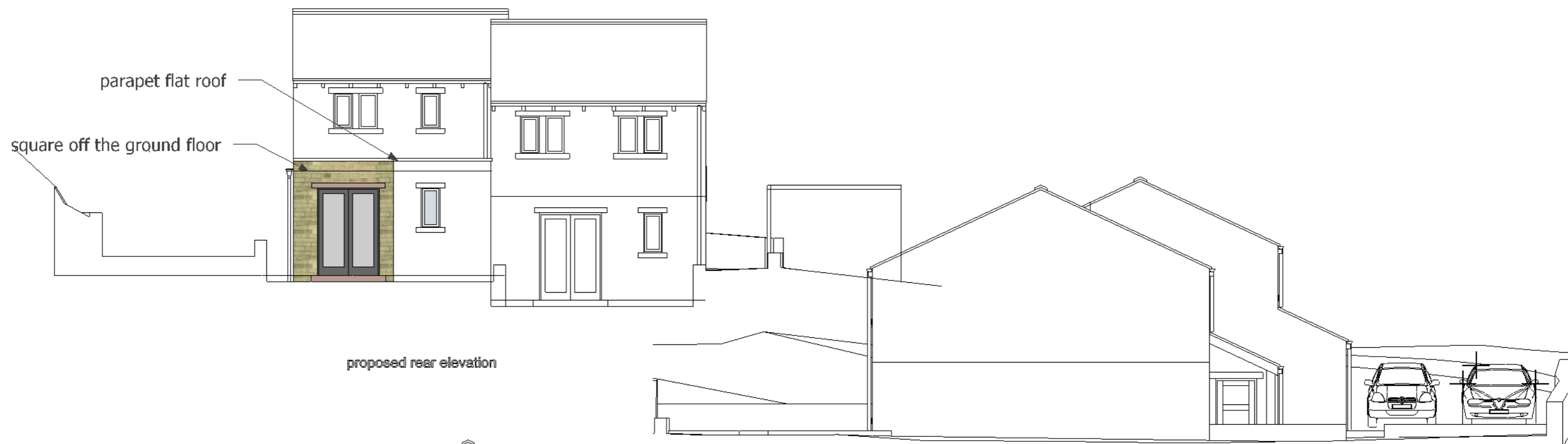
proposed rear elevation