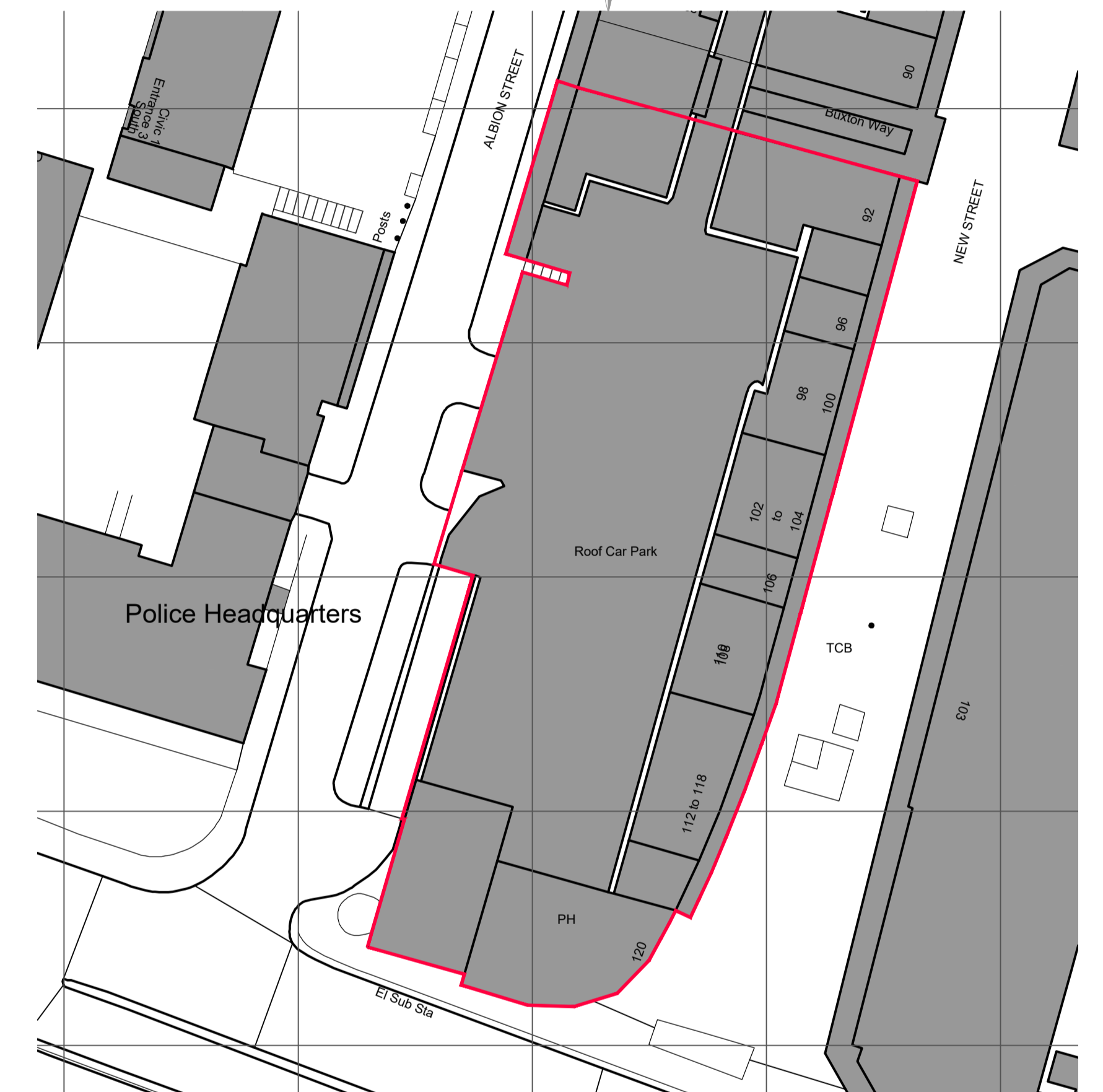
Existing Site Block Plan 1:500