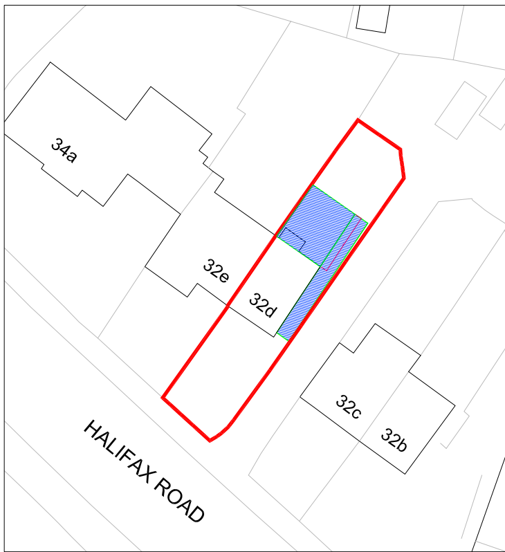
PROPOSED SITE PLAN SCALE 1:500@A3

Use figured dimensions only, DO NOT SCALE. All dimensions are in millimetres unless noted otherwise. All levels are in metres above ordnance datum unless noted otherwise. This drawing must be read in conjunction with all other relevant drawings and specifications from the Architect and other consultants. © KUFIC 2021