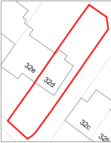
EXISTING SITE PLAN @ SCALE 1:500@A4

Use figured dimensions only. DO NOT SCALE. All dimensions are in millimetres unless noted otherwise. All levels are in metres above ordnance datum unless noted otherwise. This drawing must be read in conjunction with all other relevant drawings and specifications from the Architect and other consultants. © KUFIC 2022