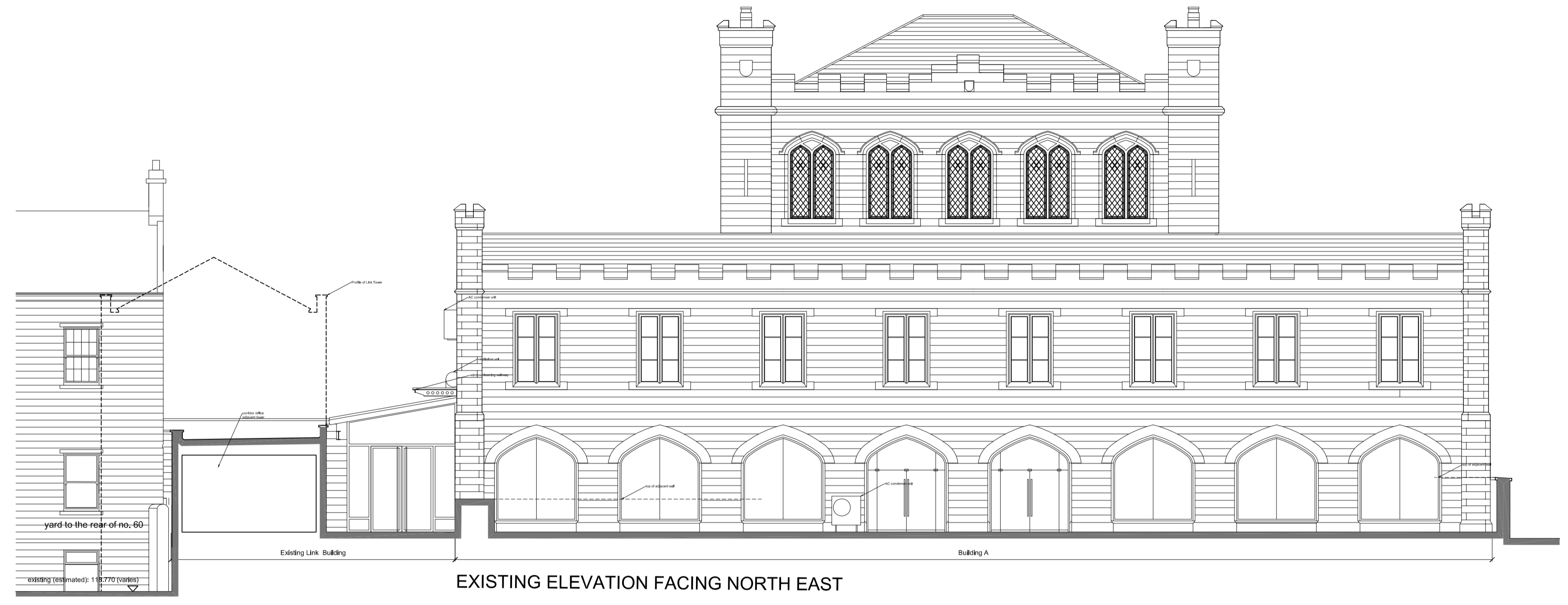
EXISTING ELEVATION FACING NORTH EAST