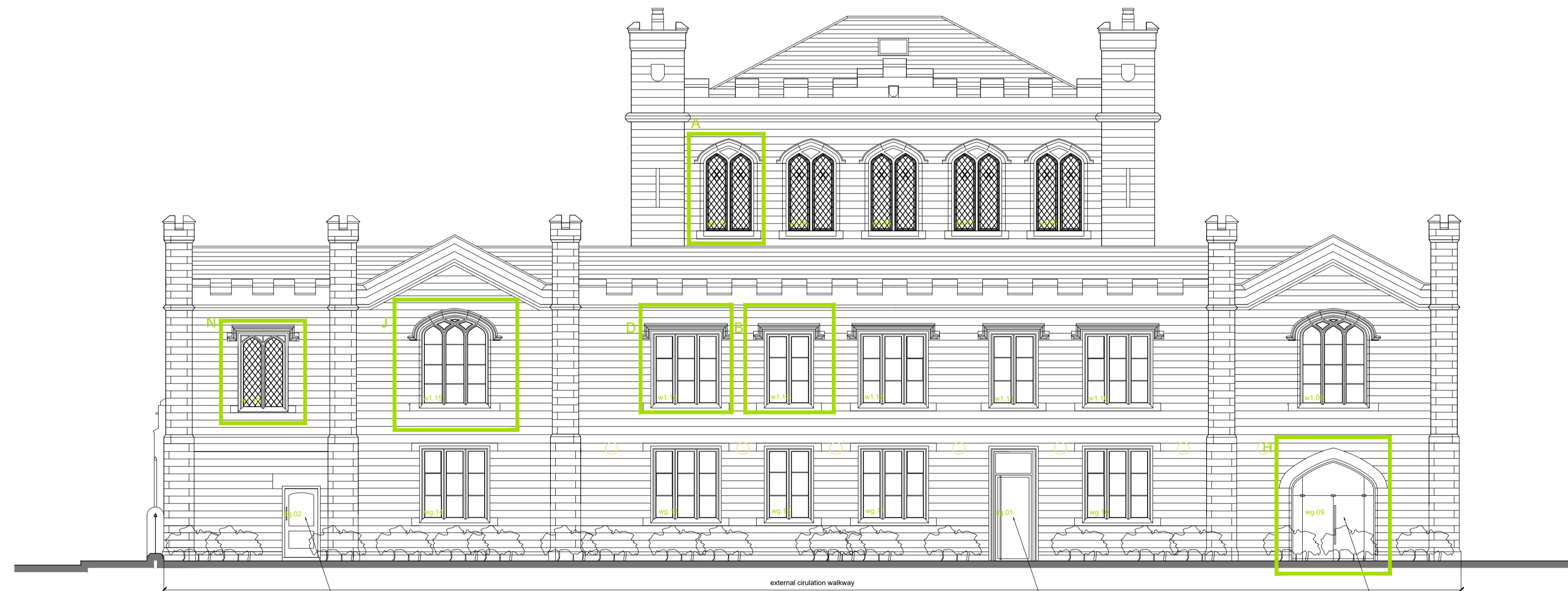
PROPOSED ELEVATION FACING SOUTH EAST

Except where indicated otherwise, all existing windows on this elevation are in good condition. No major repair work required. Opening lights raised where required. Frames to be re-painted inside and out.