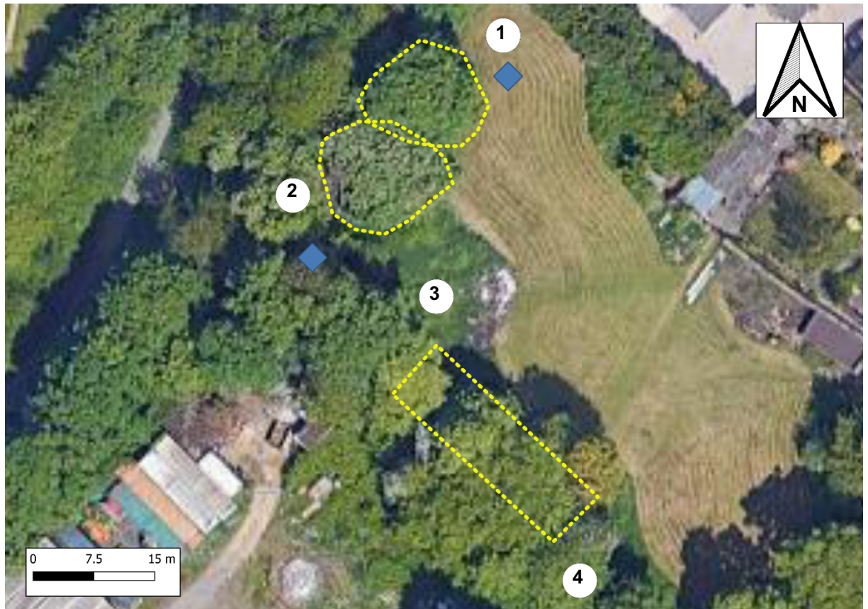
Figure 3: Surveyor locations (circled white) Infra-red camera locations (blue diamonds).

2.6.1.3 Overall, it is considered that there were no significant constraints to achieving the purpose of the assessment.