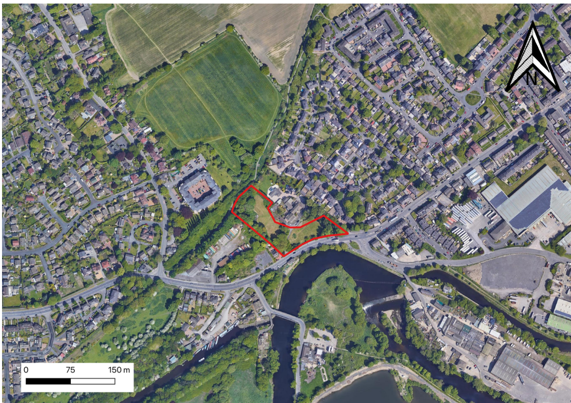
Figure 1. Survey area outlined red (aerial imagery dated 2022)