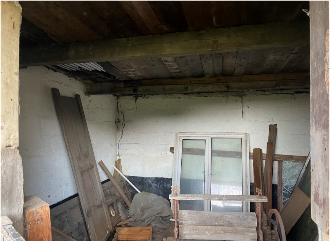
Photo 6. Internal of building with low bat roost potential