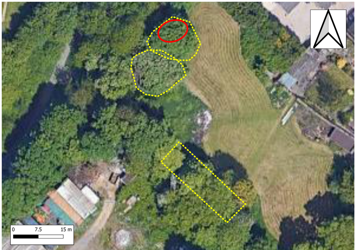
Figure 5. Sycamore Tree, view from infra-red camera with site of emergence shown within red ellipse.