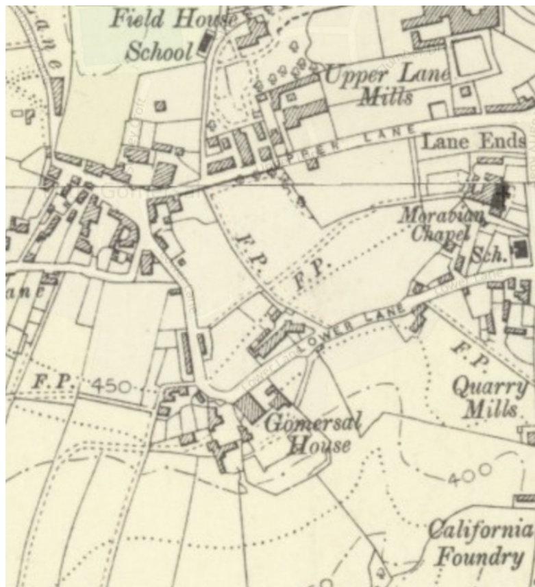
Historical map of Gomersal House