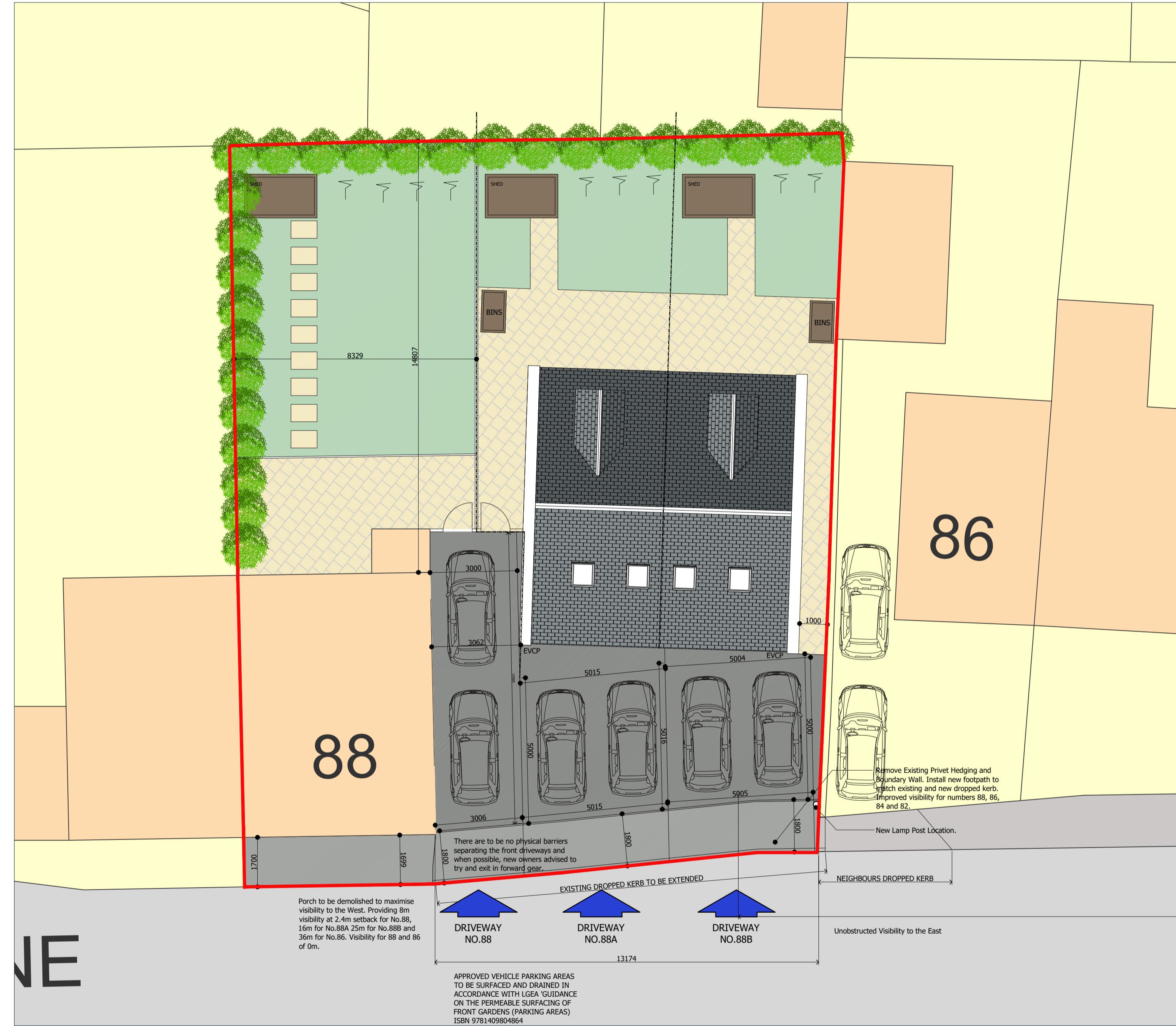
3 Proposed Site Layout Scale: 1:100