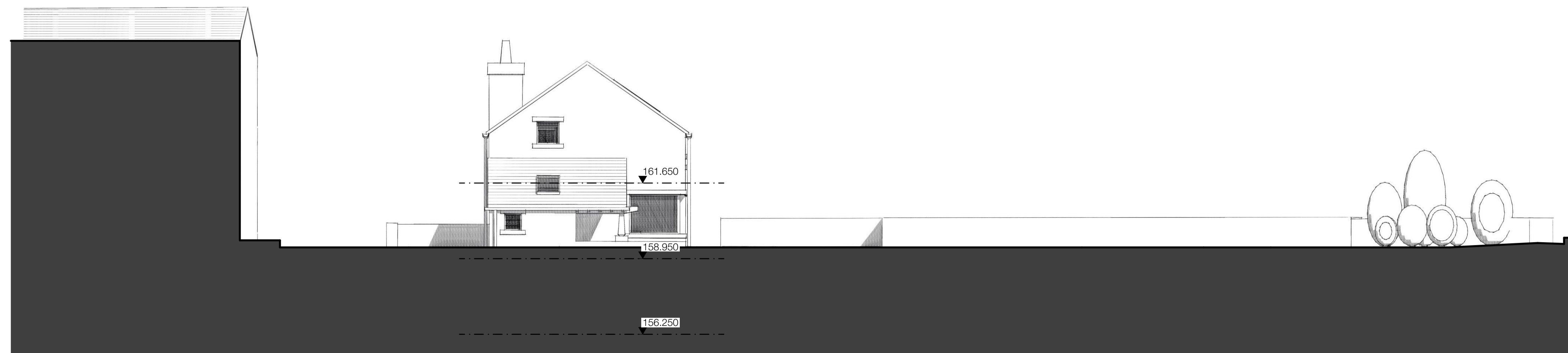
Proposed North Elevation - 1:100